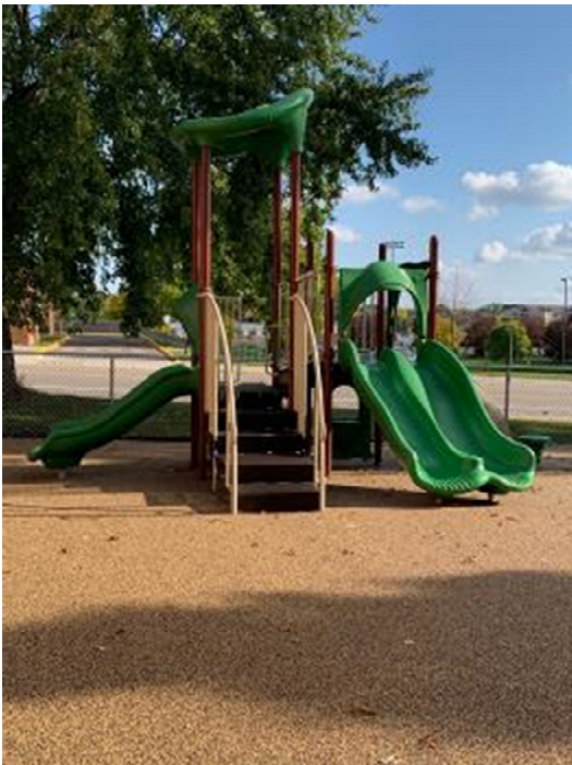
Head Start playground at St. Mark's!