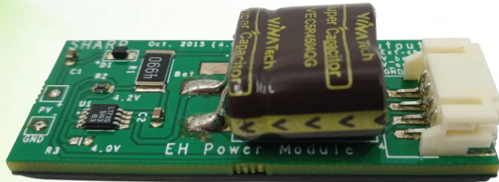
Front side (custom)