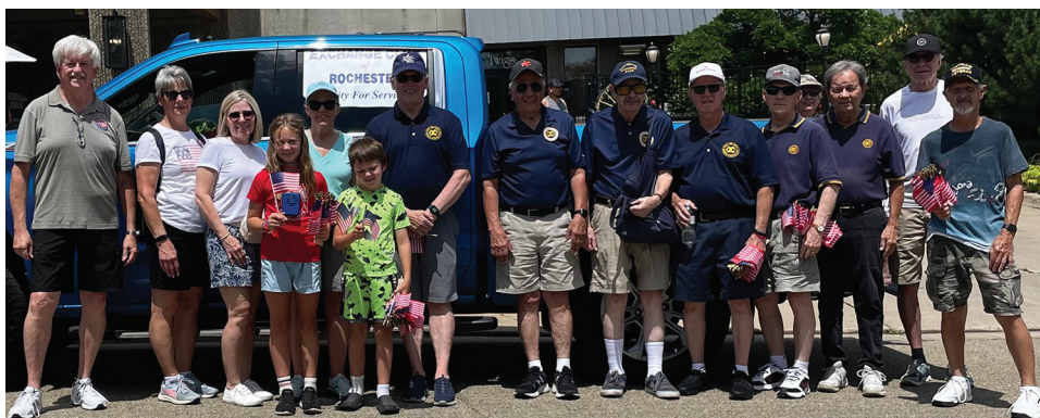
The Exchange Club of Rochester earned their National Service Award for the 2024-25 Exchange year by handing out 2,500 American flags as part of GiveAKidAFlagToWave, June 28, along the Rochester Fest parade route.