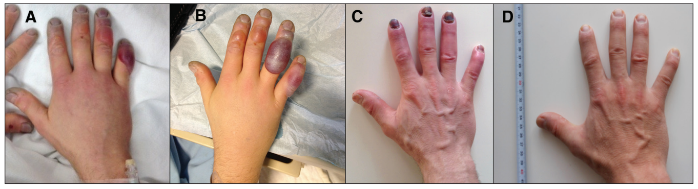
Figure 1: Case 1, a 46-year-old man with grade 3 frostbite on his right hand. (A) Day 1. (B) Day 2. (C) At one month. (D) At six months.

Diagnosis of frostbite is based on a history of cold exposure and the presence of skin changes that are not completely reversed by rewarming.