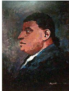
Captain Paul Cuffee Merchant / Captain / Businessman 1759 – 1817

∴ Many attempts have been made to Repatriate Blacks back to Africa, even though they did not materialize with ample resources. Some were honest attempts to provide social and economic justice for African-Americans in their homeland, while others were dishonest attempts, designed to get rid of an unwanted population.