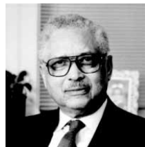
22 23 24 Rev. Leon Howard Sullivan

16 17 18 19 “Can African-Americans Save Africa” 20 21