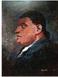
Captain Paul Cuffee Merchant / Captain / Businessman 1759 – 1817

∴ Many attempts have been made to Repatriate Blacks back to Africa, even though they did not materialize with ample resources. Some were honest attempts to provide social and economic justice for African-Americans in their homeland, while others were dishonest attempts, designed to get rid of an unwanted population.