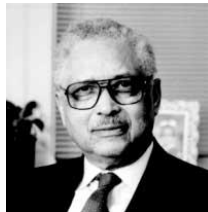
Rev. Leon Howard Sullivan

“The Faith is that Africa’s Fate is the Business of all People of African Descent”.