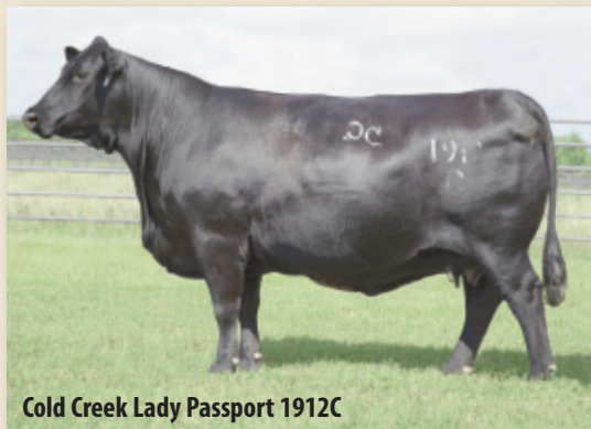
Cold Creek Lady Passport 1912C