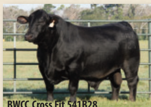
BWCC Cross Fit 541B28