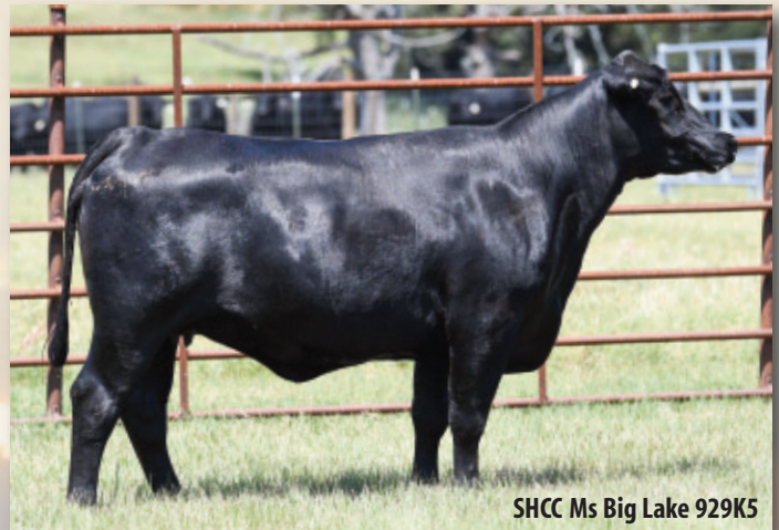
SHCC Ms Big Lake 929K5

Breeding: Pasture exposed to BWCC Johnny B 10H11, 10472287 and to MC Powerball 188J, 10485007 from 2/9/24 to 4/16/24.