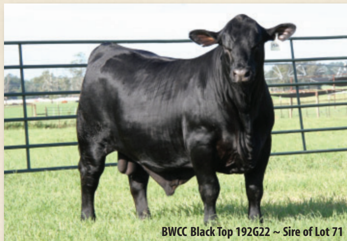
BWCC Black Top 192G22 ~ Sire of Lot 71

Breeding: Pasture exposed to BWCC Top Shelf 468H82, 10457860 from 5/15/24 to 8/1/24. Safe 55 days on 8/9/24.