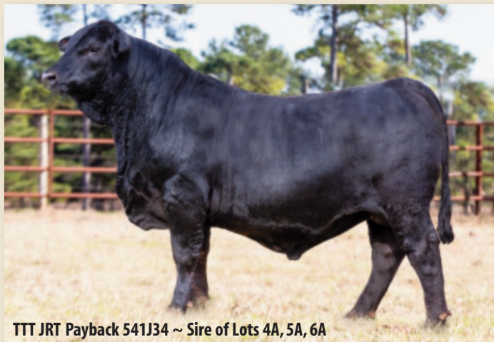
TTT JRT Payback 541J34 ~ Sire of Lots 4A, 5A, 6A