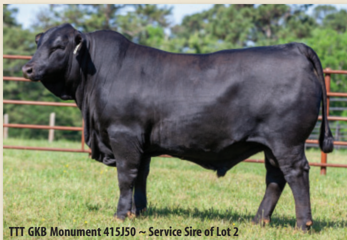
TTT GKB Monument 415J50 ~ Service Sire of Lot 2

Breeding: Pasture exposed to VF Le Mans 468J64, R10490656 from 5/20/24 to 7/21/24.