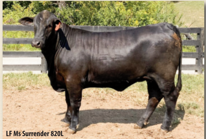
LF Ms Surrender 820L

Breeding: Pasture exposed to CRC Signal 331L5, 10535118 from 7/12/24 to 8/20/24. DDPC