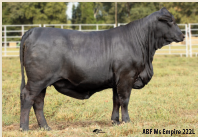
ABF Ms Empire 222L