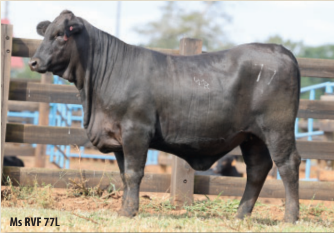
Ms RVF 77L