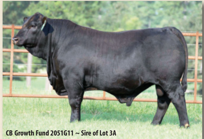
CB Growth Fund 2051G11 ~ Sire of Lot 3A