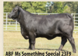
ABF Ms Something Special 23F9