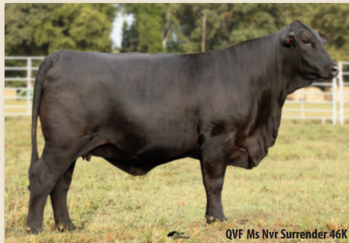
QVF Ms Nvr Surrender 46K

Breeding: AI'd to DMR Dutton 331H8, 10462638 on 5/11/24. Pasture exposed to ABF Stonewall 134L, 10534186 from 5/20/2024 to 6/16/2024 and to QVF Big Town 19L, 10524186 from 6/16/2024 to 7/27/2024.