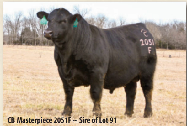
CB Masterpiece 2051F ~ Sire of Lot 91

This Masterpiece daughter is an EPD queen, posting 14 EPDs in the breed's top 25% with 10 of these traits in the breed's top 10% or better, including top 1% SC, 3% WW, 4% REA and 5% YW and IMF. Her dam was my pick of the open heifers at the 2022 CDP Sale and 1912J2 is a direct daughter of the famous 1912C donor raised by Cold Creek Ranch.