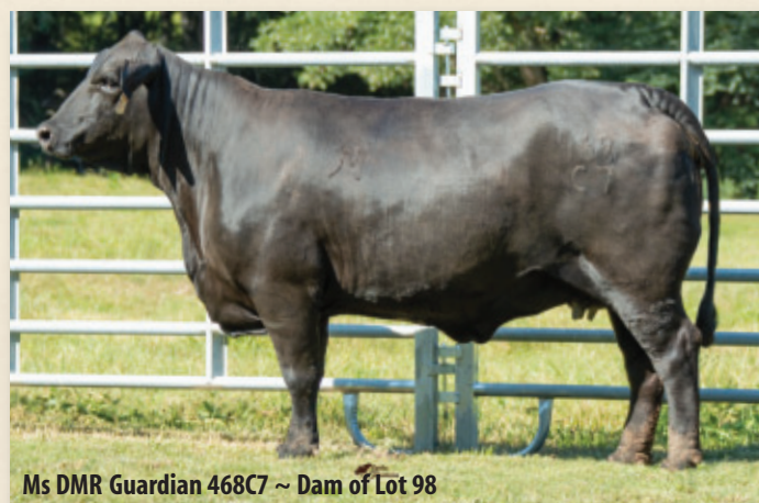
Ms DMR Guardian 468C7 ~ Dam of Lot 98