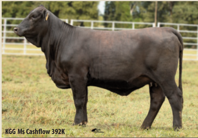
KGG Ms Cashflow 392K