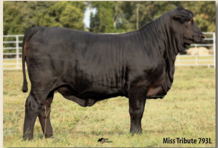
Miss Tribute 793L

Miss Tribute 793L is a very solid docile heifer that will be ready for fall breeding to the bull of your choice. This heifer has 14 EPD traits in the breeds top 45% or better, including top 15% SC, 25% TM and REA and 30% WW and YW. 793L would be a great addition to anyone's herd.