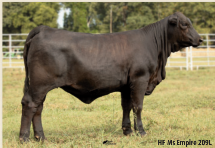
HF Ms Empire 209L

This UB heifer boasts excellent BW to WW spread. 15 traits in the breeds top 35%. She should work well with any of the power bulls.