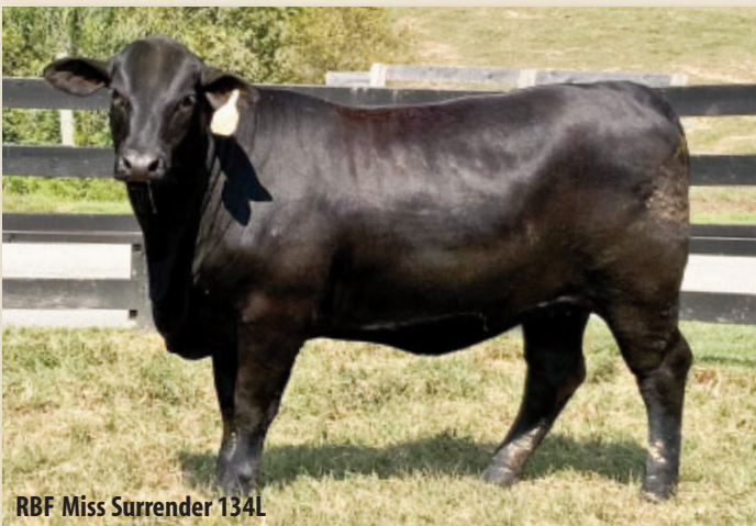
RBF Miss Surrender 134L

Breeding: Pasture exposed to CRC Signal 331L5, 10535118 from 7/12/24 to 8/20/24.