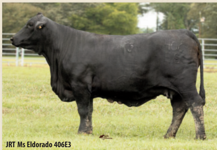
JRT Ms Eldorado 406E3

Breeding: Pasture exposed to TTT JRT Payback 541J34, 10497456 from 12/16/23 to 2/25/24.