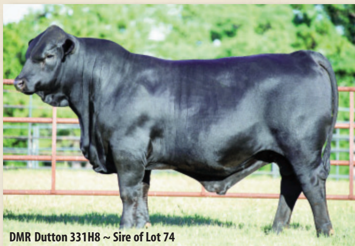
DMR Dutton 331H8 ~ Sire of Lot 74

Breeding: Pasture exposed to BWCC Top Shelf 468H82, 10457860 from 5/15/24 to 8/1/24. Safe 55 days on 8/9/24.