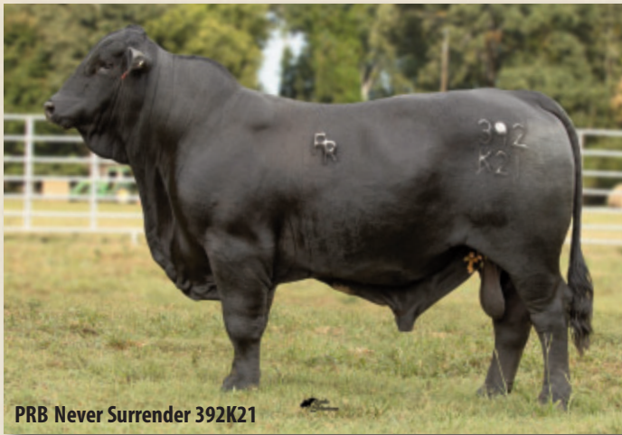
PRB Never Surrender 392K21