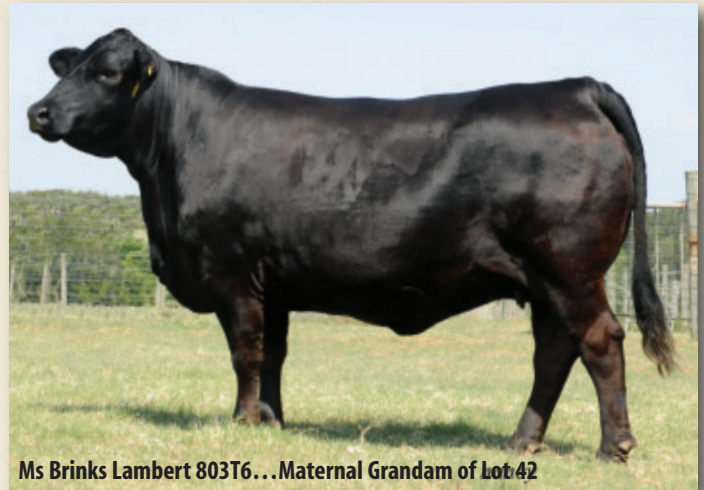
Ms Brinks Lambert 803T6...Maternal Grandam of Lot 42

Breeding: AI'd BWCC Big Town 192B16, 10266676 on 12/7/23. Pasture exposed to BWCC Top Shelf 468H82, 10457860 from 12/15/23 to 3/1/24. Safe to AI date.