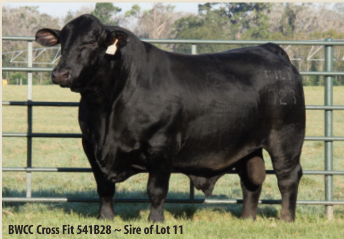
BWCC Cross Fit 541B28 ~ Sire of Lot 11