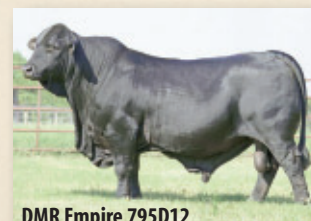
DMR Empire 795D12