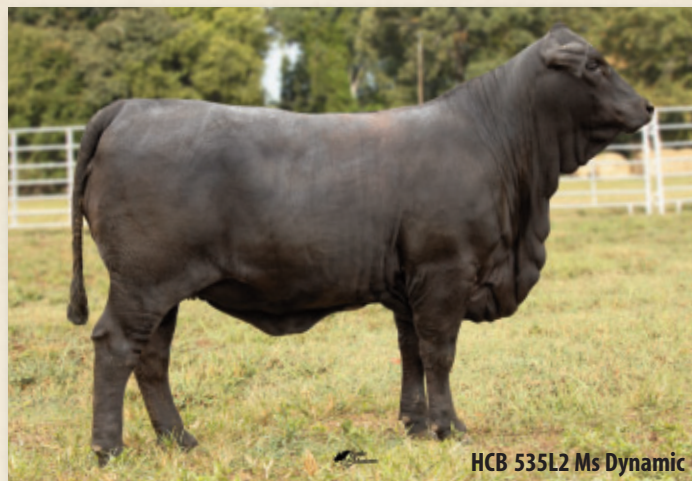
HCB 535L2 Ms Dynamic

Breeding: AI'd to DMR Dutton 331H8, 10462638 on 5/22/24. Pasture exposed to ABF Cash Flow 23K7, 10514078 from 6/1/24 to 10/10/24. Confirmed 3-1/2 months safe to AI date on 9/19/24.