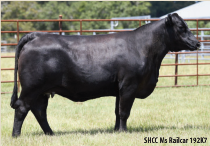
SHCC Ms Railcar 192K7

Breeding: Pasture exposed to BWCC Johnny B 10H11, 10472287 and to MC Powerball 188J, 10485007 from 2/9/24 to 4/16/24.