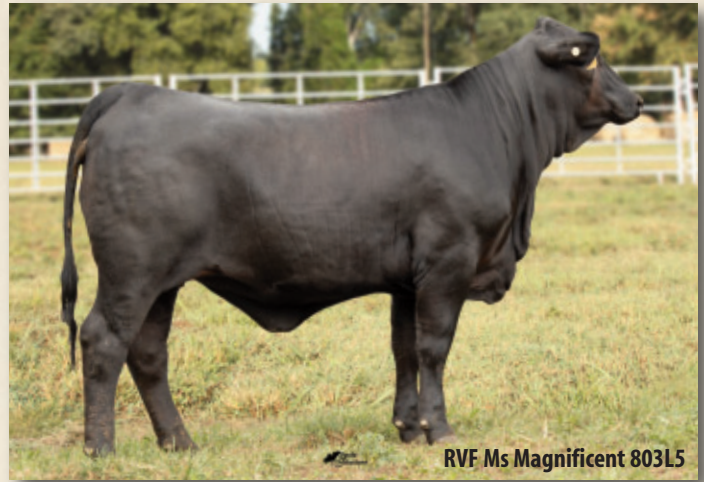
RVF Ms Magnificent 803L5

Breeding: AI'd to Paramount 7139H2, 10445139 on 5/30/24. Pasture exposed to DMR Innovation 331K22, 10531500 from 6/1/24 to 8/1/24.