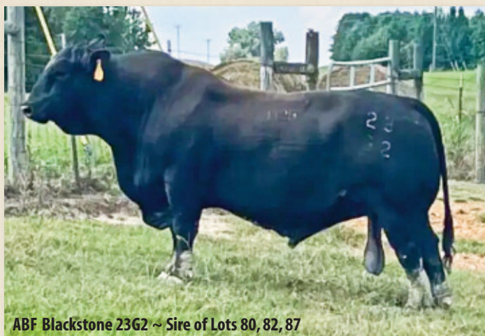
ABF Blackstone 23G2 ~ Sire of Lots 80, 82, 87