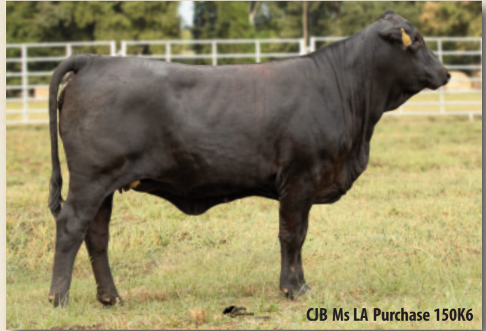
CJB Ms LA Purchase 150K6

Breeding: AI'd to DMR Investment 535F40, R1038660 on 8/25/24.