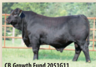
CB Growth Fund 2051G11