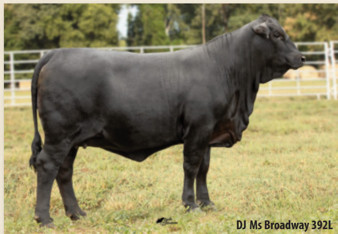
DJ Ms Broadway 392L

Diamond J Farm is proud to offer 392L as our first registered consignment in this year's sale. She is a second-generation show heifer who just like her dam has had great success in the show ring. More importantly, we expect her to be successful in the pasture as a brood cow. Being sired by T3 Broadway and out of our Suhn's Foundation cow she offers a balanced set of EPDs with pleasing phenotype and a gentle disposition. 392L was intentionally held open for this sale and will be ready for the bull of your choice in December.