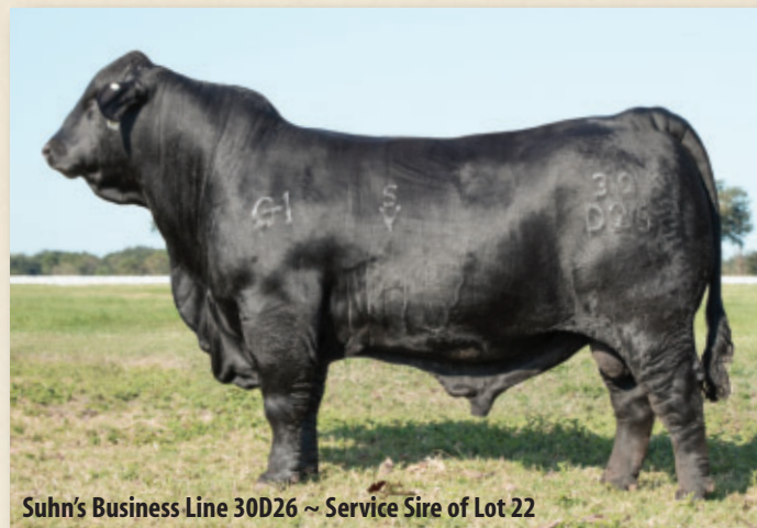
Suhn's Business Line 30D26 ~ Service Sire of Lot 22

Breeding: AI'd to Suhn's Business Line 30D26, 10327046 on 1/26/24.