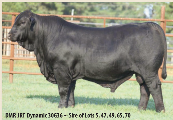
DMR JRT Dynamic 30G36 ~ Sire of Lots 5, 47, 49, 65, 70

415L4 is a powerful bred heifer sired by the now-deceased Dynamic bull. She is a smooth, correctly made female. She boasts an incredible 9 EPDs in the top 35%, led by top 3% WW, 4% Heifer Pregnancy, 5% YW, 10% REA, top 15% TM, Terminal, and top 20% Stay. You will appreciate the look and style of this Dynamic daughter. Semen is in short supply, so take advantage of this opportunity. We bred her to the exciting young Cash Flow son TTT JRT Payback 541J34 owned by my good friends from JRT Brangus and TTT Ranches. Safe in calf. Breeding: AI'd to TTT JRT Payback 541J34, 10497456 on 5/13/24. Pasture exposed to TTT JRT Payback 541J34 from 5/24/24 to 8/30/24.