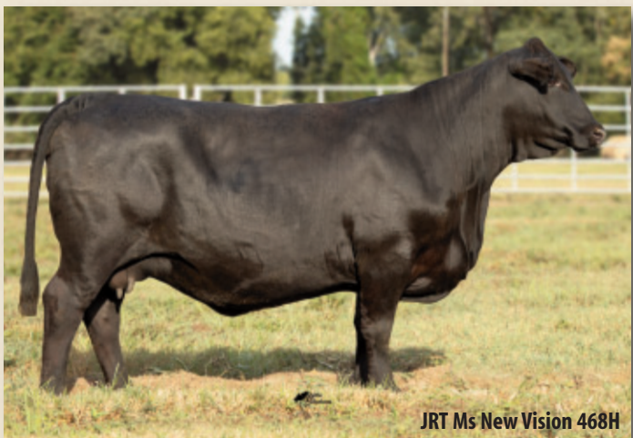
JRT Ms New Vision 468H