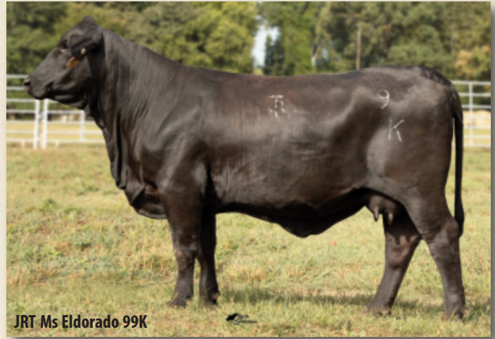
JRT Ms Eldorado 99K

Breeding: AI'd to DMR Admiral 535K13, 10505245 on 5/13/24. Pasture exposed to TTT JRT Payback 541J34, 10497456 from 5/25/24 to 8/30/24.