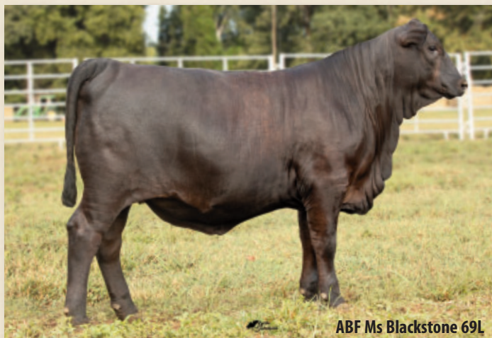
ABF Ms Blackstone 69L

When we decided to get into the seedstock business in 2020, we dreamed of raising females like this. 30L4 is an embryo transfer calf sired by Blueprint, making her a paternal sister to the $23,000 high-selling open heifer at the 2023 Sale at Chimney Rock and out of our $18,000 30H51. This maternal powerhouse combines three generations of donor cows from the Suhm herd in 30H51, 30D3 and 30Z3 and ties in Beacon, 2A and 30Z5 on the paternal side of her pedigree. 30L4 combines her royal lineage with an EPD profile boasting a top 3% WW, top 2% YW, top 2% SC, and top 10% REA, Heifer Preg and Terminal Indexes. She presents in a moderate, easy-doing package with a friendly disposition and will be ready for the bull of your choice in December.