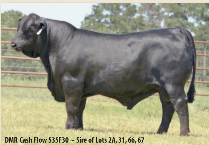
DMR Cash Flow 535F30 ~ Sire of Lots 2A, 31, 66, 67

Breeding: AI'd to TTT GKB Monument 415J50, R10481752 on 7/13/24.