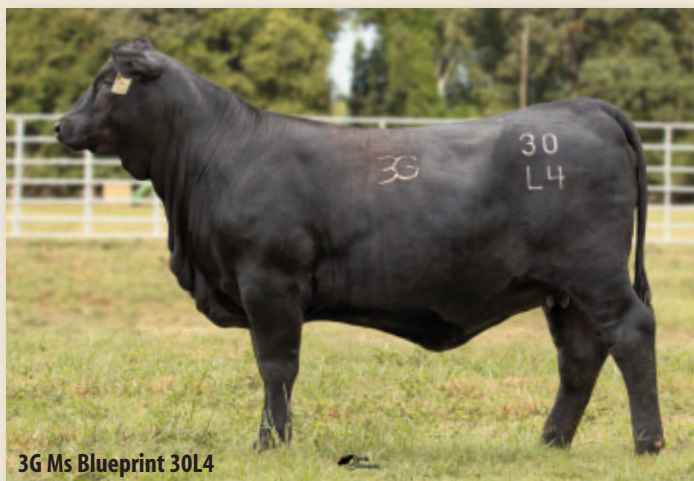
3G Ms Blueprint 30L4

Blackstone females seem to get better each calving season. This feminine Blackstone daughter, unfortunately, lost part of her tail to the coyotes as a young calf but is too good of a heifer to leave out of our sale. She has 14 EPD traits in the breeds top 40% or better, including top 20% IMF and REA, 25% BW, WW, YW, TM and SC and a trait much needed in our breed, 40% MILK. Her dam has a 375-day calving interval. Buying fertility!