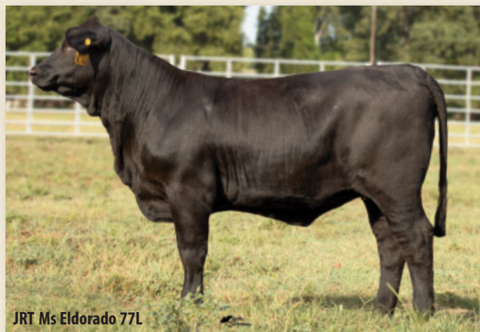
JRT Ms Eldorado 77L

A calving ease daughter of the living legend DMR Eldorado 30B15! Eldorado daughters continue to impress and she is no different with 8 EPDs breed average or better including top 20% BW, and 25% CED. She has a great disposition and is open and ready to breed to the bull of your choice.