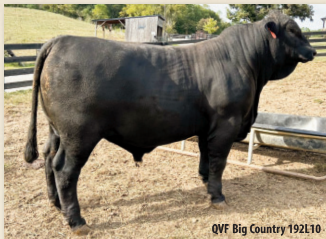
QVF Big Country 192L10

Check out this big-bodied, deep-made bull by BWCC Big Country 158F14 and out of a maternal sister to BWCC Big Town 192B16. A super nice bull with a great pedigree!