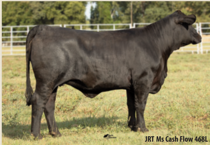
JRT Ms Cash Flow 468L

Breeding: AI'd to TTT GKB Monument 415J50, R10481752 on 5/18/24.