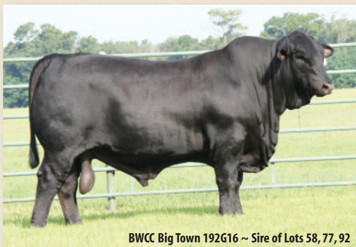
BWCC Big Town 192G16 ~ Sire of Lots 58, 77, 92

Every year that we have had our sale, there seems to be a standout heifer that catches my eye, that I would like to keep for myself, but always feel like I need to take my best heifers to best represent our farm. Well, 1912L2 is this year's pick. She is a feminine and correct female with a good disposition. Ms Big Town has 14 EPD traits in the breeds top 35% or better, including top 1% Heifer Preg., 2% REA, 10% WW and 15% YW. I feel like this fancy female should be in someone's donor pen in the near future!