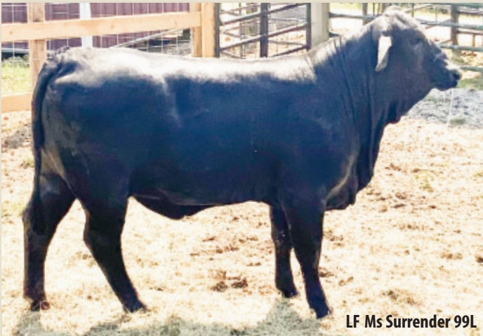
LF Ms Surrender 99L

Breeding: AI'd to DMR Express 415J134, 10480419 on 4/13/24. Pasture exposed to Salacoa Perfect Fit 201J8, 10485080 and QVF Big Town 192K12, 10504448 from 5/1/24 to 8/4/24.