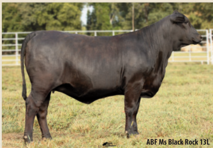
ABF Ms Black Rock 13L

interval. Due to her age, we had to sell 13W. Ms Black Rock will be the last of our 13-cow family. She has 15 EPD traits breed average or better. Consider this last 13-cow family heifer! Breeding: AI'd to TTT JRT Payback 541J34, 10497456 on 5/11/24. Pasture exposed to ABF Stonewall 134L, 10534186 from 5/20/2024 to 6/16/2024 and to QVF Big Town 19L, 10524186 from 6/16/2024 to 7/27/2024.