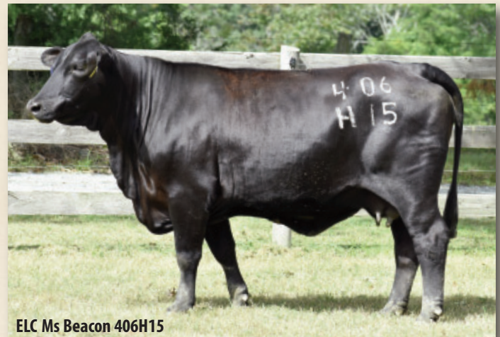
ELC Ms Beacon 406H15

Breeding: Pasture exposed to ACE Kingdom 209K2, 10495537 from 6/10/24 to 8/17/24.