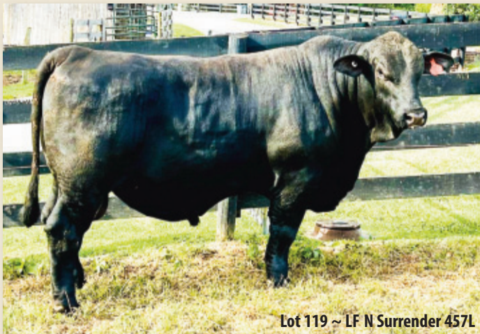
Lot 119 ~ LF N Surrender 457L

Here is a bull sired by the great Never Surrender bull and the 392G3 cow. He has impressive power with top 2% YW and top 3% BW. He also is top 3% REA. Check this bull out.