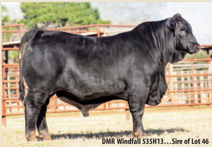
DMR Windfall 535H13...Sire of Lot 46

13L is our first Black Rock daughter to sell as a bred female. Black Rock is our good Empire son that we raised out of our future donor, 27E2. 13L's dam was our purchase from the Salacoa Valley Sale, October 2011. Since then, she has produced 11 calves for us and has maintained a 398-day calving