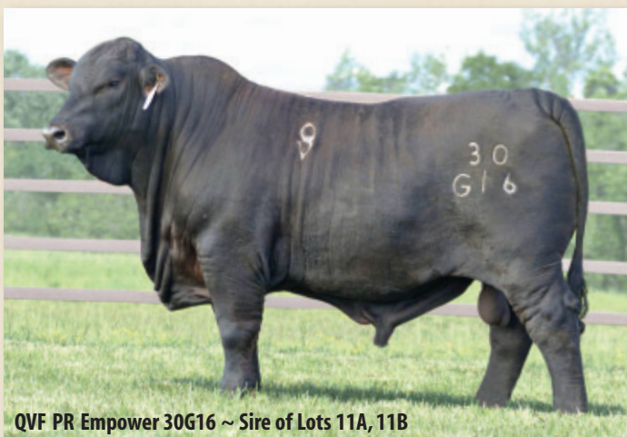
QVF PR Empower 30G16 ~ Sire of Lots 11A, 11B