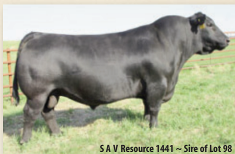
S A V Resource 1441 ~ Sire of Lot 98

If you need a later aspiration date, you can discuss it with Wayne. Buyer is to pay all fees including semen on the bull of your choice.