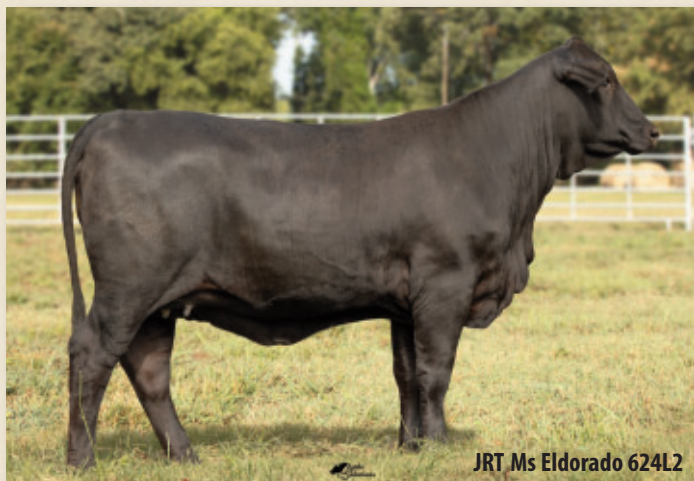
JRT Ms Eldorado 624L2

Breeding: AI'd to CB Growth Fund 2051G11, 10418754 on 5/13/24. Pasture exposed to TTT JRT Payback 541J34, 10497456 from 5/25/24 to 8/30/24.