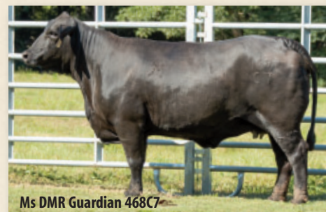
Ms DMR Guardian 468C7