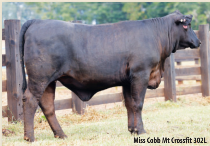
Miss Cobb Mt Crossfit 302L

Breeding: AI'd to DMR Dutton 331H8, 10462638 on 5/11/24. Pasture exposed to ABF Stonewall 134L, 10534186 from 5/20/2024 to 6/16/2024 and to QVF Big Town 19L, 10524186 from 6/16/2024 to 7/27/2024.