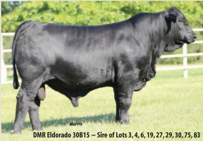
DMR Eldorado 30B15 ~ Sire of Lots 3, 4, 6, 19, 27, 29, 30, 75, 83

Breeding: AI'd to DMR Admiral 535K13, 10505245 on 5/13/24. Pasture exposed to DMR Eldorado 30B15, 10284830 from 5/25/24 to 8/30/24.