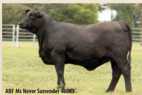
ABF Ms Never Surrender 468K3