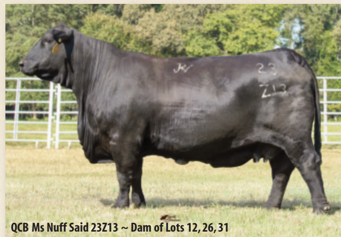
QCB Ms Nuff Said 23Z13 ~ Dam of Lots 12, 26, 31

Breeding: Pasture exposed to ABF Blackstone 23G2, 10410461 from 12/4/23 to 2/25/24.