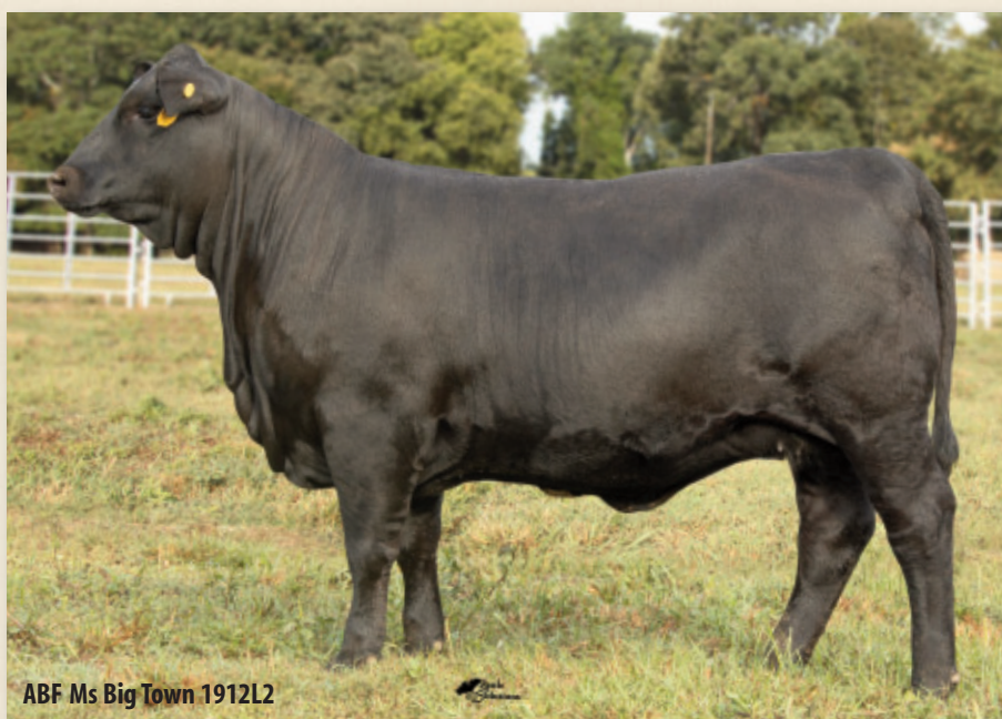
ABF Ms Big Town 1912L2