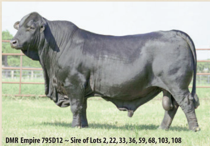
DMR Empire 795D12 ~ Sire of Lots 2, 22, 33, 36, 59, 68, 103, 108

Breeding: AI'd to DMR JRT Dynamic 30G36, 10434661 on 5/13/24. Pasture exposed to DMR Eldorado 30B15, 10284830 from 5/25/24 to 8/30/24.