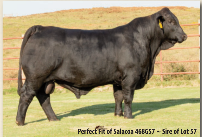
Perfect Fit of Salacoa 468G57 ~ Sire of Lot 57

Breeding: Pasture exposed to BWCC Top Shelf 468H82, 10457860 from 5/15/24 to 8/1/24. Safe 30 days on 8/9/24.