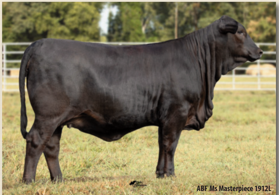
ABF Ms Masterpiece 1912L