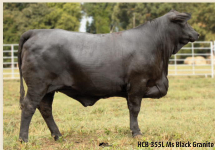
HCB 355L Ms Black Granite

Breeding: AI'd to DMR Empire 795D12, 10323531 on 5/22/24. Pasture exposed to ABF Cash Flow 23K7, 10514078 from 6/1/24 to 10/10/24. Confirmed 3-1/2 to 4 months safe to AI date on 9/19/24.