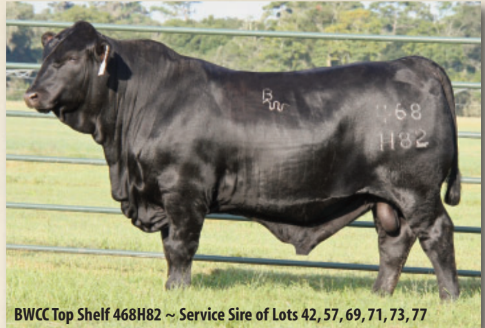
BWCC Top Shelf 468H82 ~ Service Sire of Lots 42, 57, 69, 71, 73, 77

Breeding: Pasture exposed to BWCC Top Shelf 468H82, 10457860 from 5/15/24 to 8/1/24. Safe 30 days on 8/9/24.