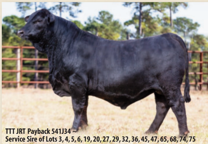
TTT JRT Payback 541J34 ~ Service Sire of Lots 3, 4, 5, 6, 19, 20, 27, 29, 32, 36, 45, 47, 65, 68, 74, 75

Breeding: AI'd to VF Inferno 468J52, R10490647 on 5/16/24. Pasture exposed to VF Take Over 889J2, UB10490626 from 05/28/24 to 08/26/24.