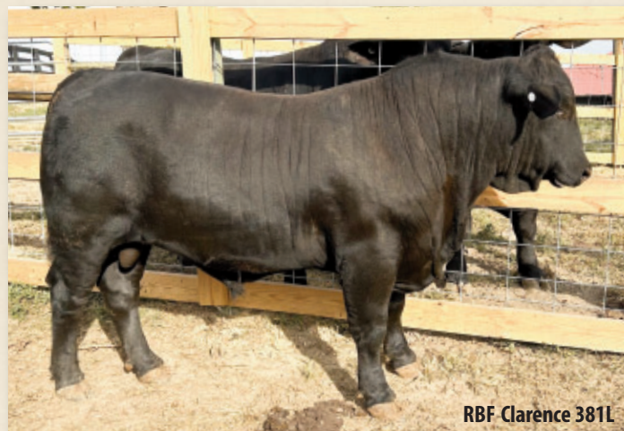
RBF Clarence 381L

Here is a really nice-built bull, with an outstanding disposition. 381L should be a great candidate for breeding heifers. He is in the breed's top 2% for Calving Ease and top 4% for Birth Weight. DDPC