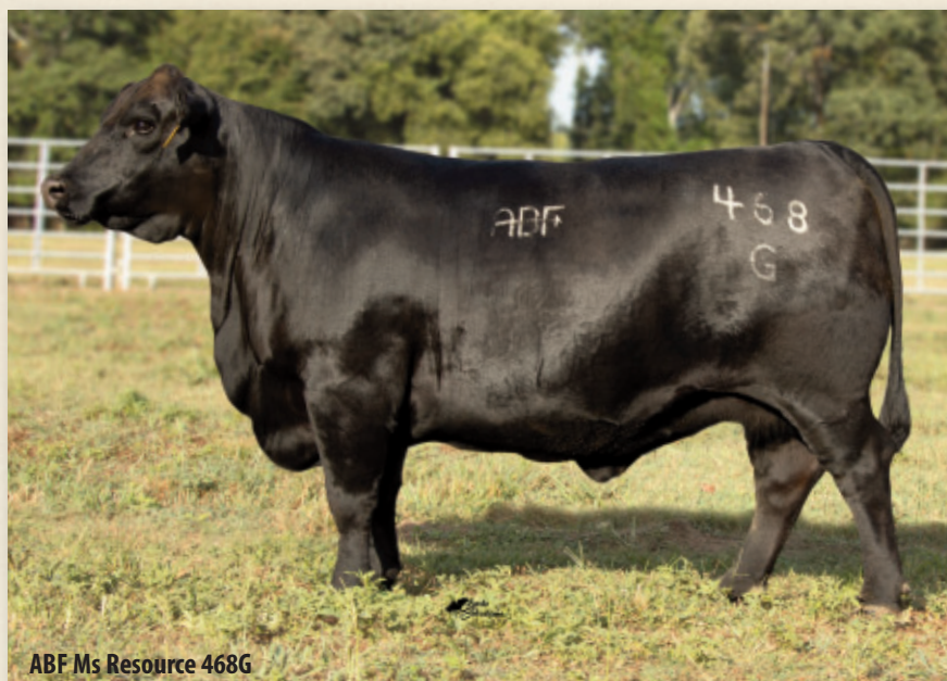
ABF Ms Resource 468G