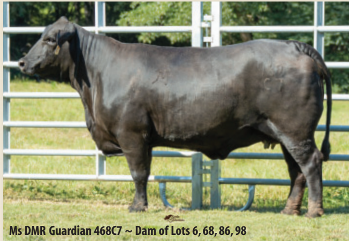
Ms DMR Guardian 468C7 ~ Dam of Lots 6, 68, 86, 98

Stout made Payback bull calf with 13 EPDs breed average or better.