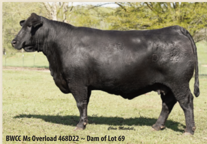
BWCC Ms Overload 468D22 ~ Dam of Lot 69

Breeding: AI'd BWCC Big Town 192B16, 10266676 on 5/8/24. Pasture exposed to BWCC Top Shelf 468H82, 10457860 from 5/15/24 to 8/1/24. Safe 60 days on 8/9/24 to AI date.