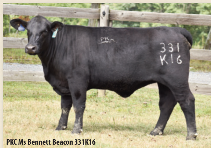
PKC Ms Bennett Beacon 331K16

Breeding: AI'd to MC Blue Blood 129H18, UB10480215 on 5/31/24. Pasture exposed to ACE Kingdom 209K2, 10495537 from 6/10/24 to 8/17/24.