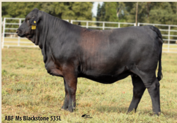
ABF Ms Blackstone 535L

Ms Monument is a deep-made, good-boned heifer with 14 EPD traits in the breed's top 25%, including top 10% fertility numbers.