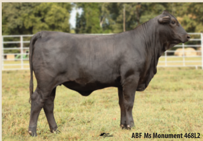
ABF Ms Monument 468L2