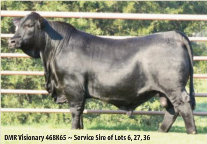
DMR Visionary 468K65 ~ Service Sire of Lots 6, 27, 36