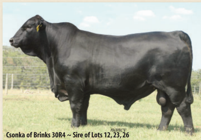
Csonka of Brinks 30R4 ~ Sire of Lots 12, 23, 26

Breeding: AI'd to DMR Cash Flow 535F30, 10386538 on 1/26/24.