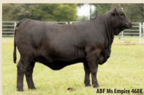
ABF Ms Empire 468K