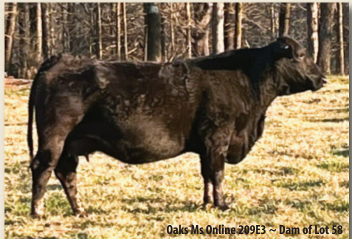
Oaks Ms Online 209E3 ~ Dam of Lot 58

Breeding: AI'd to DMR Dutton 331H8, 10462638 on 5/29/24. Pasture exposed to DMR Innovation 331K22, 10531500 from 6/1/24 to 8/1/24.