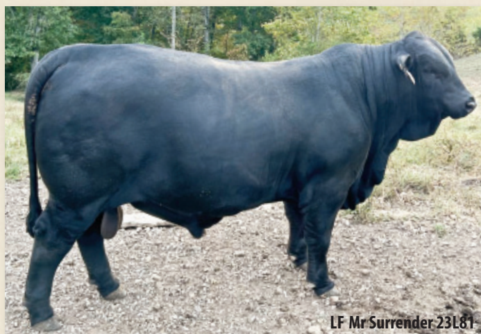
LF Mr Surrender 23L81

We want to bring the best. Here is a super son of Never Surrender out of the Addition Something Special donor. His EPDs and Indices are led by top 5% YW, 10% WW, REA, TM, CEM, 15% TI, Fert, NC, with CED and Milk at 35% of the breed.