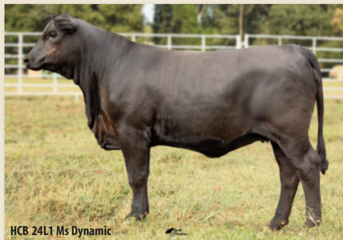
HCB 24L1 Ms Dynamic

Breeding: AI'd to DMR Dutton 331H8, 10462638 on 5/22/24. Pasture exposed to ABF Cash Flow 23K7, 10514078 from 6/1/24 to 10/10/24. Confirmed 2-1/2 to 3 months safe on 9/19/24.