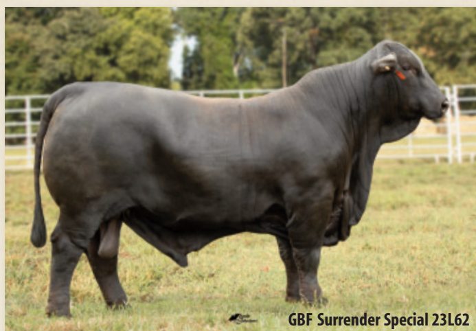
GBF Surrender Special 23L62