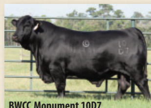
BWCC Monument 10D7