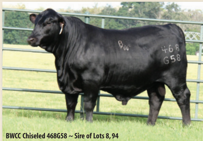
BWCC Chiseled 468G58 ~ Sire of Lots 8,94

Breeding: Pasture exposed to BWCC Black Top 192G22, R10444674 from 5/28/24 to 8/26/24.