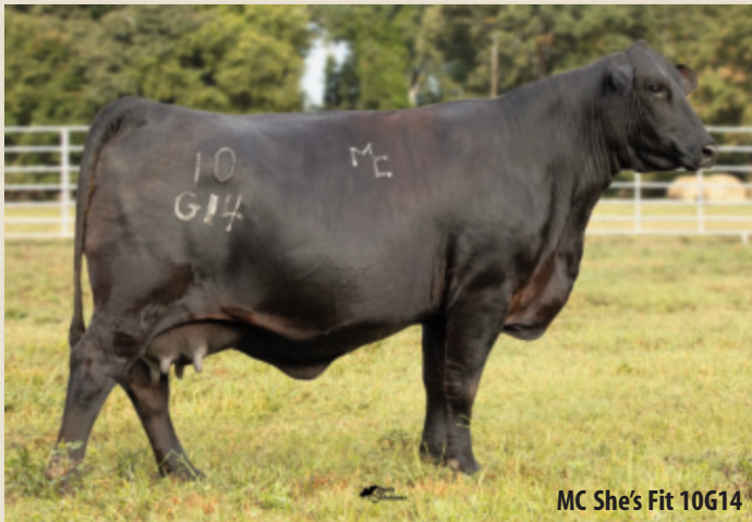
MC She's Fit 10G14

Addison Brangus purchased this attractive embryo transfer Cross Fit daughter out of the 2020 Mound Creek Ranches spring sale as an open heifer. She has 12 EPD traits in the breeds top 40% or better, including top 5% WW, 10% YW and 20% REA. With her twin bull calves at side, she should make a great addition to any Brangus herd.