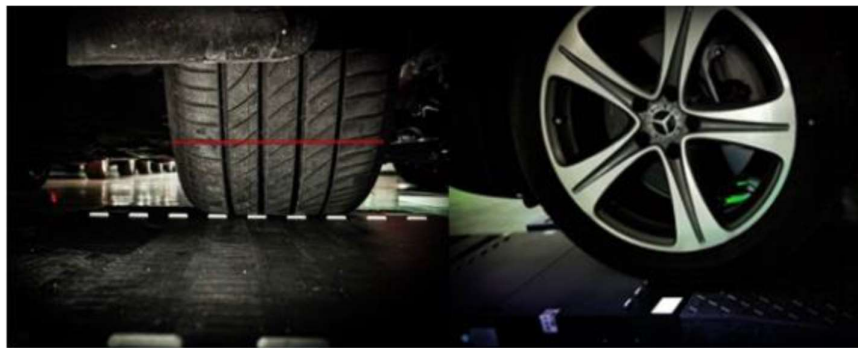
Tread depth measurements

TDF series Automatic Tire Tread Depth Scanner , can help you easy and quick to do the detection. All you need to do is to driving through the scanner, a report will be issued in 4 seconds , with accuracy up to 0.0039 in (0.1mm) . The equipment is easy to install and maintain, and is wind and waterproof.