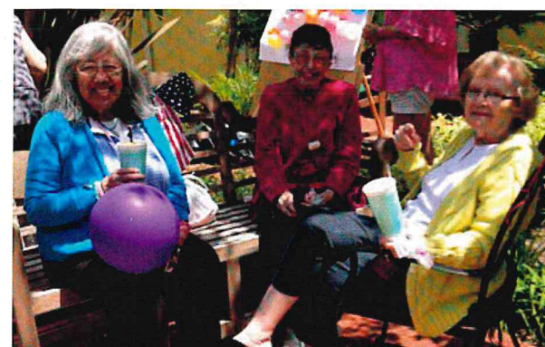
Garden Court residents at Garden Court's very first Carnival.

We hope this will help you share your passion for Garden Court Endowment with friends and colleagues!