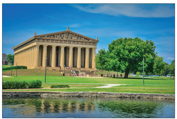
A stop on the optional Trolley Ride, the Nashville Parthenon is the only full-scale replica of the original one. You can't see this in Greece , folks, because Nashville's the only place in the World where you can see it as the ancient Greeks originally built it. In 1990 they even added a replica of the 42 foot statue of Athena inside. It was gilded in 2002.

The President's Banquet starts at 5:00pm with a cash bar and Dinner Buffet served at 6:30pm.