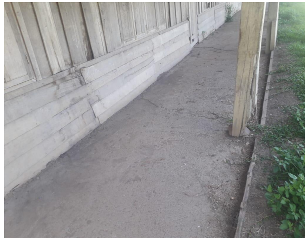
Photos of the Nong Mai Primary School to be renovated