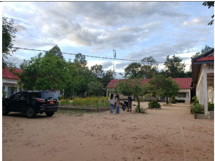
Inside School Compound