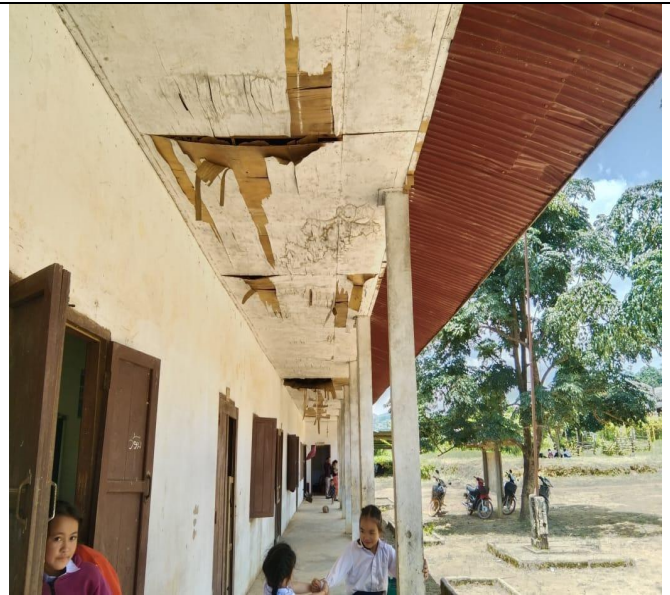
Current conditions at Ban Pha Lower Secondary School, Muang Pha Xay District, Xiangkhouang Province.