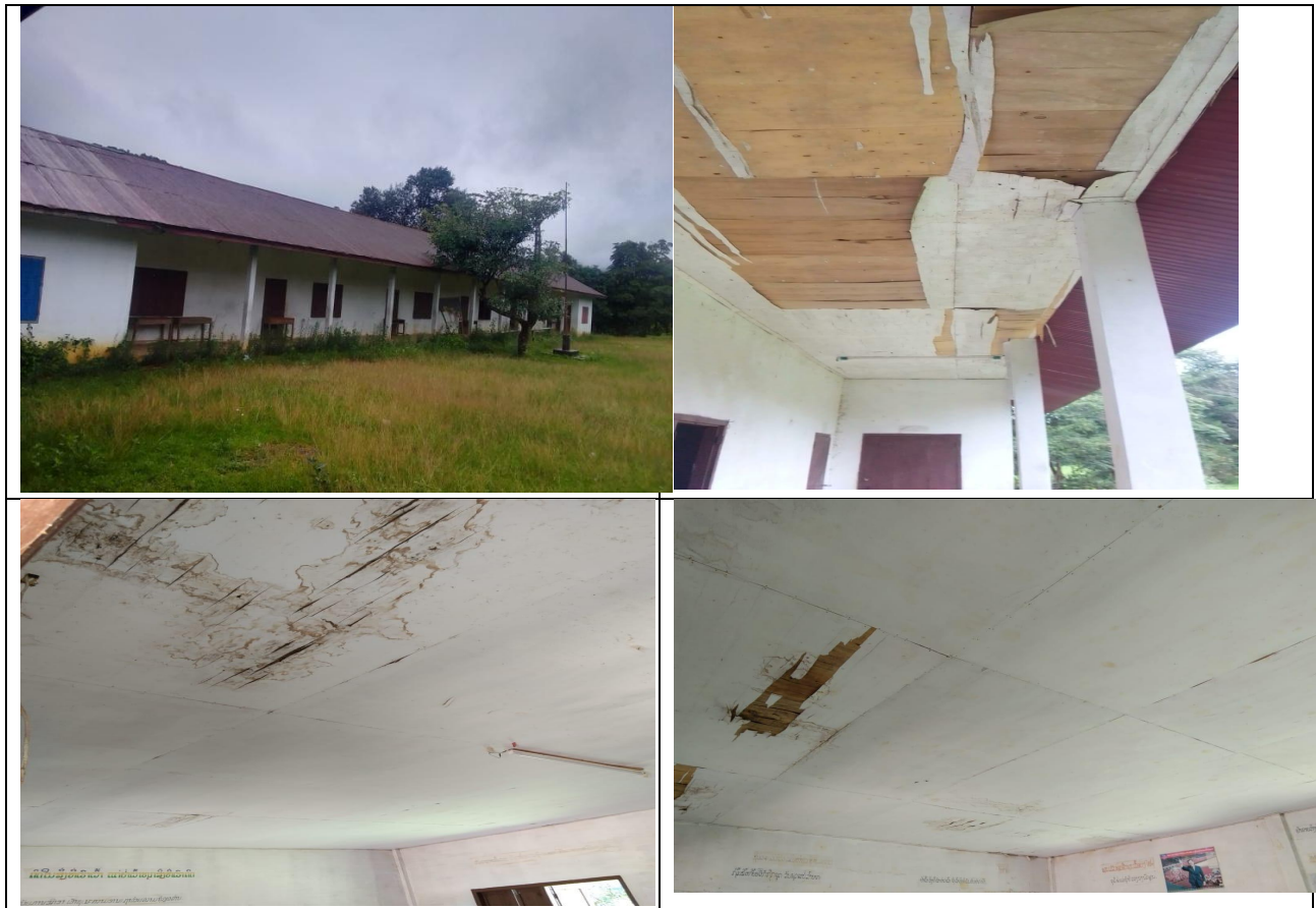
Condition of the building can be seen in the photos above

Labor for this will be the responsibility of the villagers.