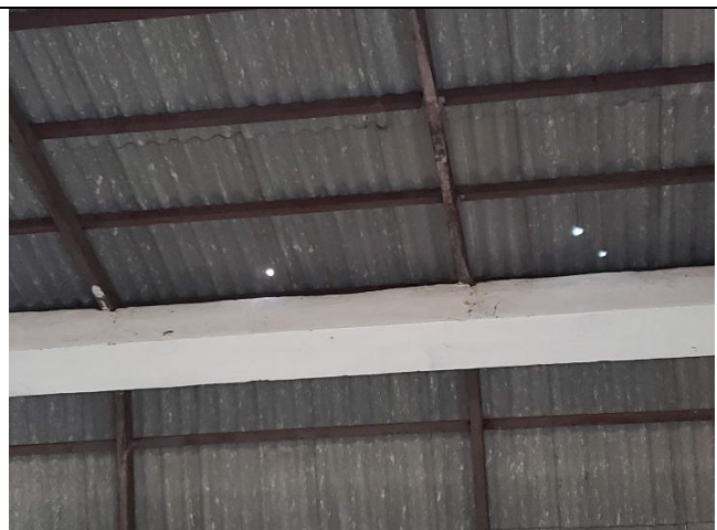
Holes in roof. Water leaks into classroom