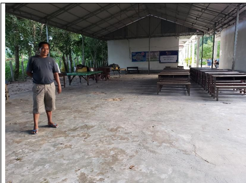
Cafeteria needing new floor