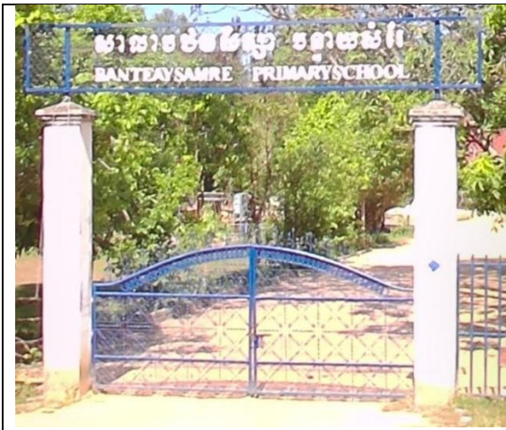
Entrance to the School