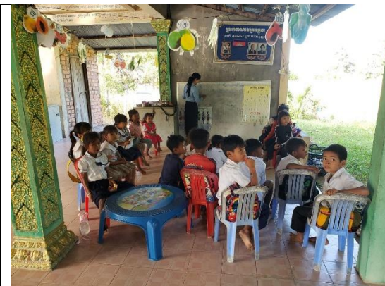
Kindergarten class: on this day ½ students absent were with parents harvesting rice

The school and villagers make this request for funds to expand their Community Center to the President of the Thai-Lao-Cambodia Friendship Association. This request is made through local authorities from the Thmat Pong area.