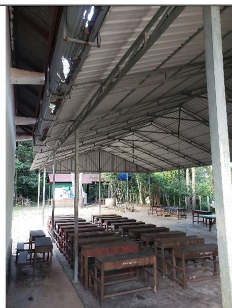
Leaking gutter to replace