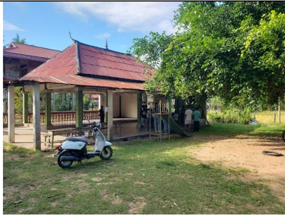
4 m roof extension will expand the pavilion on the right side towards tree