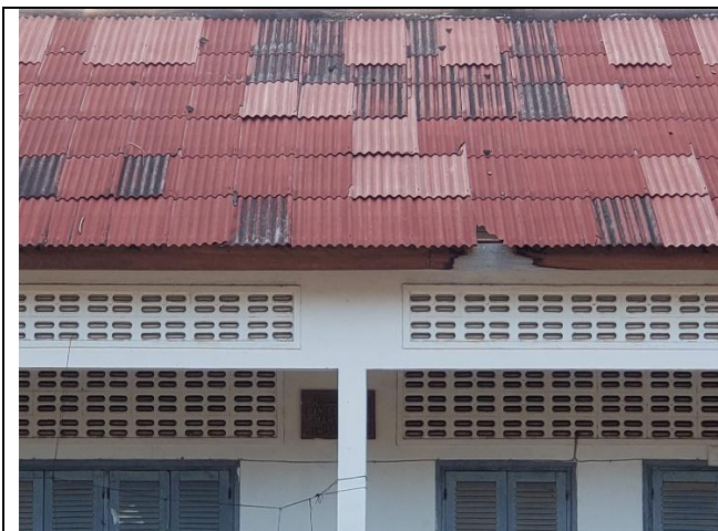
One of two buildings needing new roof