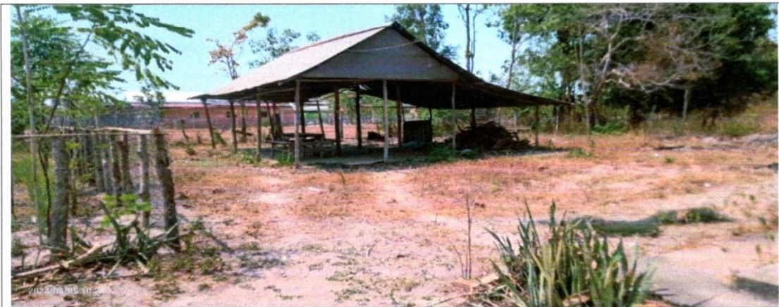
The ruined kitchen (meal shelter) to be repaired and restored