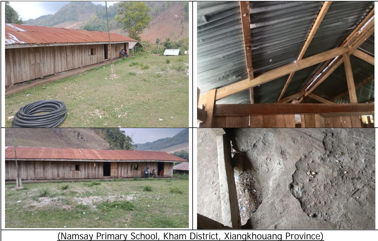
(Namsay Primary School, Kham District, Xiangkhouang Province)

In current situation, if it rains, it is not possible to study. The school also proposed this issue to the Government and various relevant organizations, but no one has cooperated yet. If this issue relies on the community to mobilize money to buy building materials and equipment to repair it, it will be very difficult. On the other hand, the villagers of this village are not strong enough to collect the money to buy corrugated roofing sheets for the replacement of the roofs.