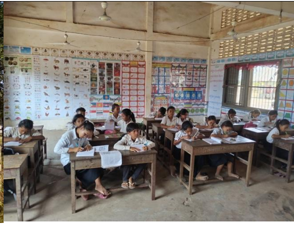
Inside the Classroom