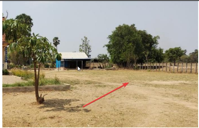
The Zone Planned for the Dining Hall (10x20 m)