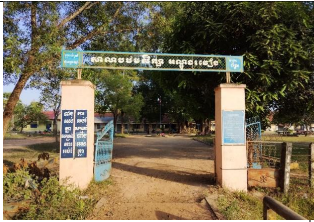
Andoung Rovieng Front Gate