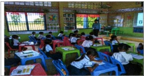
In the Classroom