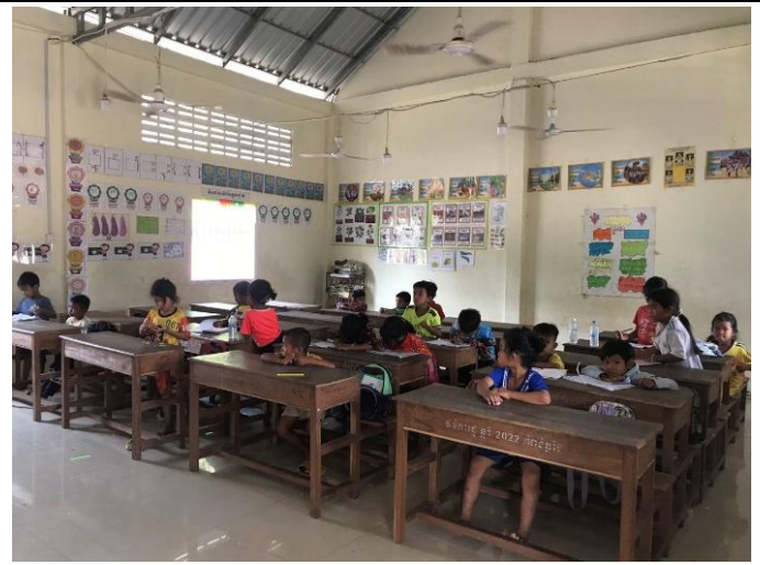
Inside the Classroom