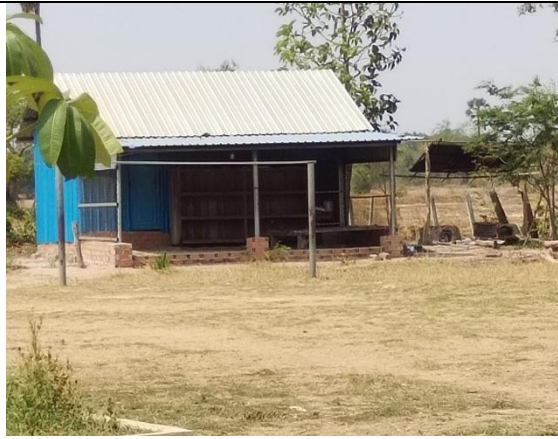
Kitchen (6x9 m)