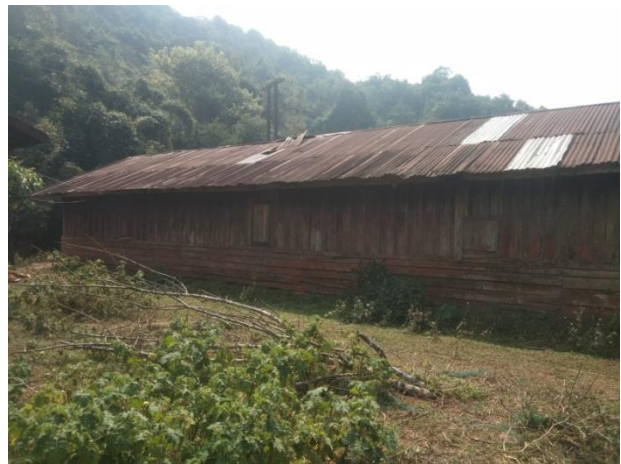
Primary School at Nhod Lieng Village Kham District, Xiangkhouang Province

In this school year, there are 7 male teachers and 4 female teachers. There are 132 students of which 61 are female. The village has a large population, with 133 houses distributed along the main road.