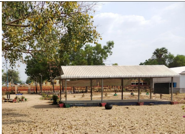
Classroom without protective wall (7x9m)