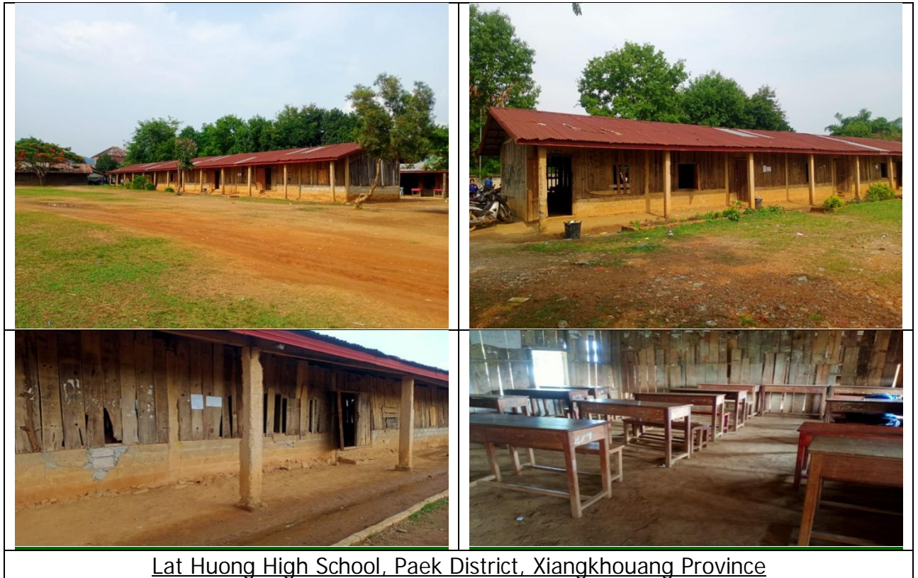
Lat Huong High School, Paek District, Xiangkhouang Province

In the past, the area's educational development committee and the committee responsible for the school raised funds from many sectors in order to repair the school building, but it was not enough fund, because of high costs for the renovation, and as it was a large school building. While the Government does not allow to use the student's budget, like in the past, renovations are left for the community to find funds themselves.