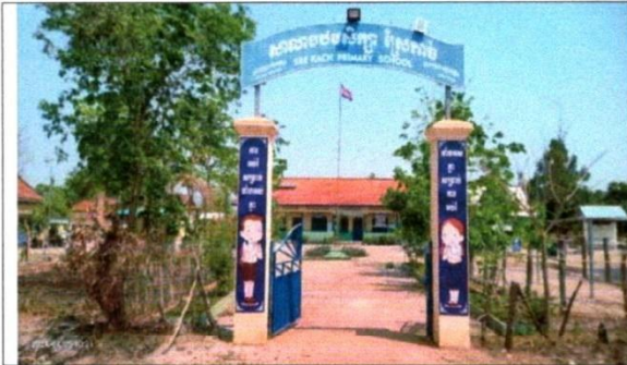
Front Gate of Sre Kach Primary School