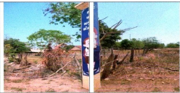
Fence to be Constructed (110 m)