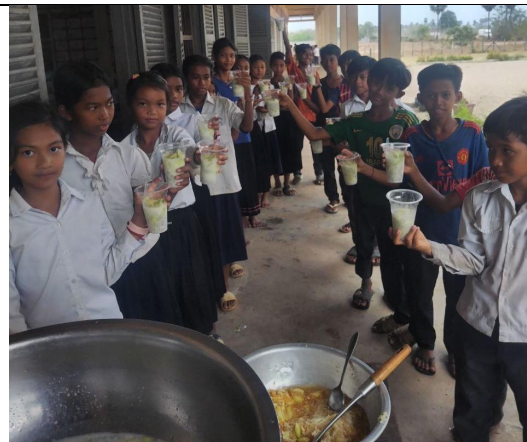
Meal for the students