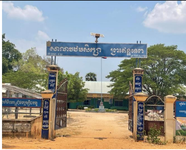
Preah En Tep Front Gate