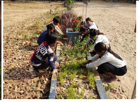
The students are taking care of their school by cleaning up and watering the plants.