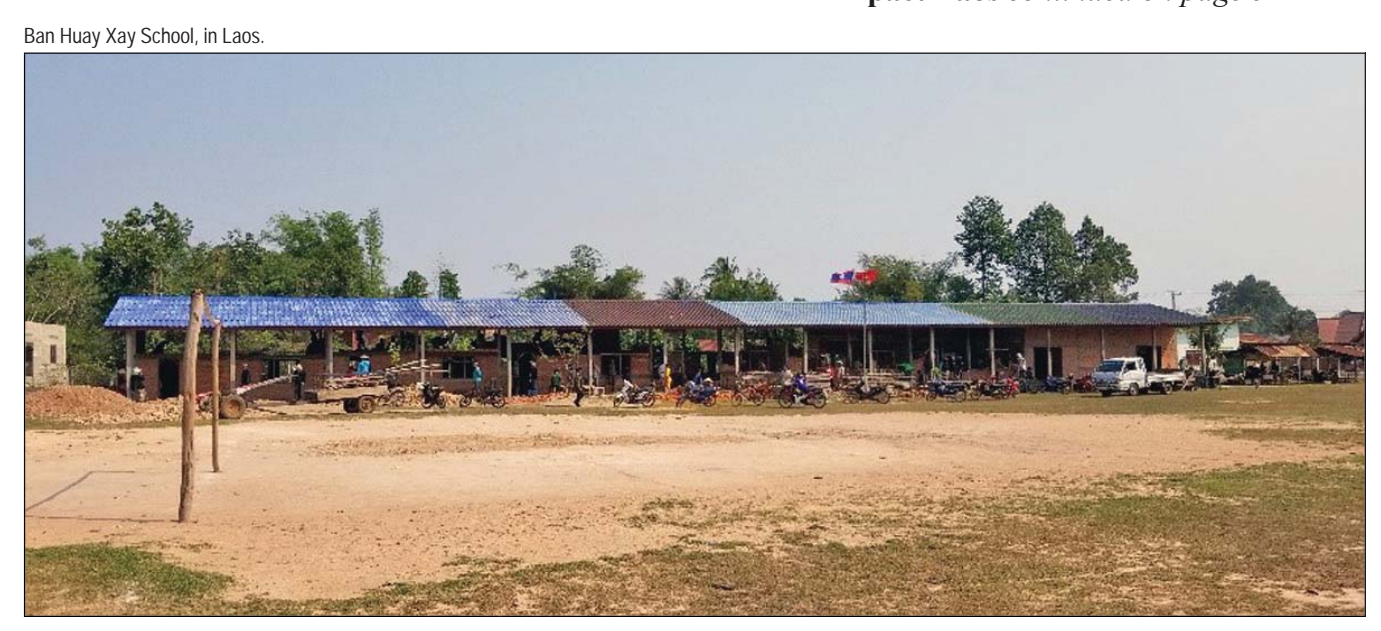
The Mekong Express Mail