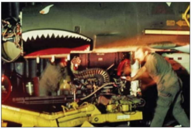
Replacing M-61A1 in F4-E at Da Nang

After tech school at Lowry AFB, I was sent to McConnell AFB in Wichita, Kansas, where I worked on F-105s and was initiated into the gun shop. In June 1970, I was on my way to Nakhon Phanom, Thailand, a place I had heard never heard of; and once I talked about it with guys who had just returned, I didn't know whether to believe the stories I heard or not. Most turned out to be BS after I got there, but some were spot on, especially about the pride of being a part of the mission