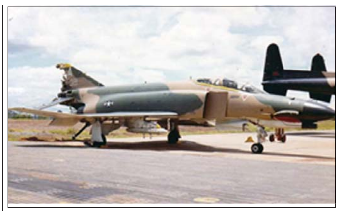
LA-321, F-4E landed at NKP with battle damage

that included rescuing pilots from Laos, Cambodia, and North Vietnam.