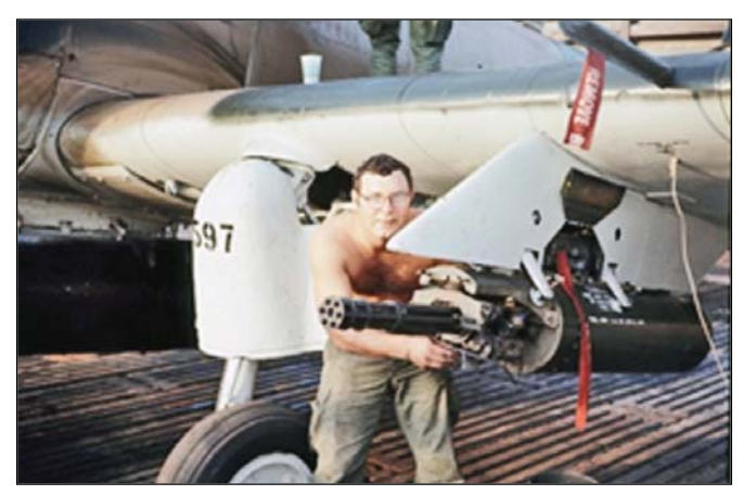
SUU-11 mini gun work at NKP

I did things that could be considered really stupid back then, but I'm glad I did them. I met a Navy Lieutenant C-2 pilot