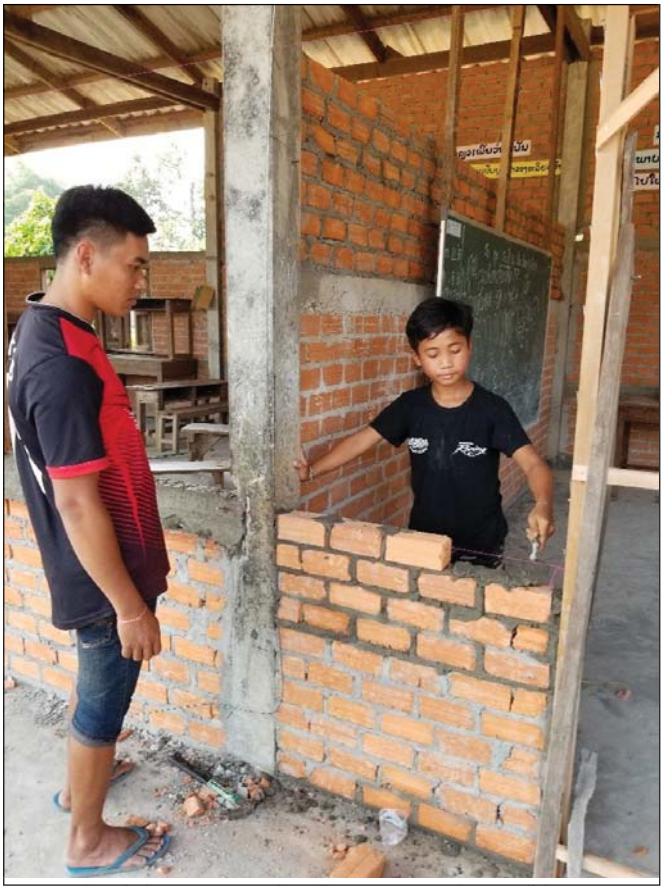
People from ten surrounding villages came together to collaborate in enlarging and improving this district school. Bricks are handmade and wood is from local sources, and funding is from members of the TLC Brotherhood.

When we finally arrived at the district school we saw that TLCB-funded construction was well underway on the project