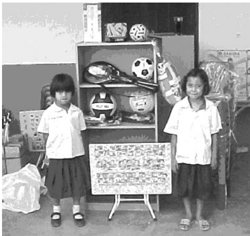
Above: ABC worktables, chairs, sports equipment, ceiling fans, wall lockers and bookshelves finish out our donation to this school. They still need a new roof and could also use a computer. However, we currently have 15 schools on our waiting list that also need your help!