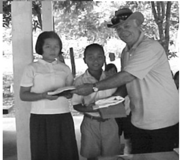
The principals and staffs of the schools we have helped have often noted improved learning as a result of TLCB help.