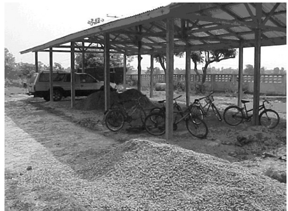
Above: Part of our donation to this school was to provide the materials to make the concrete pad to make it possible to complete the lunch room.

I later met with the head master of the school to see what we could do to help. I submitted his request for assistance and about a year later it finally made its way to the top of our waiting list. We made another trip to the school to see if their needs had changed since the initial request. The school now has a new head master who has either repaired some of the desks or found some used ones and he had started construction of a new lunchroom about six months ago and the limited funds only allowed him to get this far (photo, below).