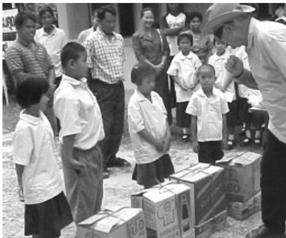
Above, Left: So often we see banners and signs expressing the gratitude of students, school staff, and parents for the things TLCB has provided to them. This is at Ban Narathakwai Noi school.