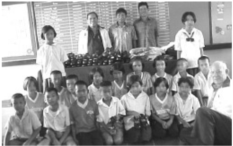
Above: Nong Bua Ratchakwai elementary school. Not only is this small school probably the poorest one that TLCB helps, but it is the only one we know of in NKP area that accepts handicapped children. Out of about 250 students there are Downes syndrome, autistic, and partially deaf children. The table is laden with donated shoes and school clothing, and TLCB provides food packets to six needy students at this school.