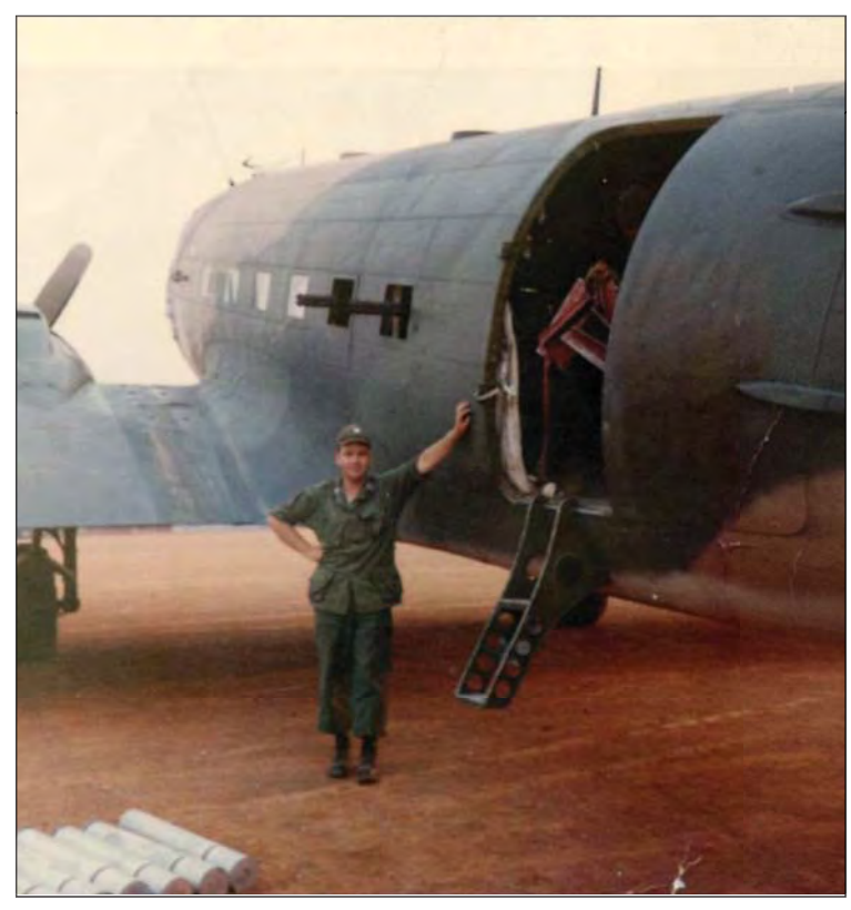
Above, me, leaning against the AC-47. I went up that night and flew over the Plaines de Jarres, and behind Phou Kout, the hill the Pathet Lao owned. I must admit flying it at night was very disorienting. It was almost impossible to find a landmark to get a fix. The aircrew had a Starlight scope (very new technology then), but this happened during the dry season, and there were literally hundreds of lights on the ground. Campfires or something else? It was impossible to tell. It was doubly frustrating, as the AC-47 was a new, scarce resource, and it was unlikely that we would get another chance at it. We didn't.

Let me digress here a little. The air war in Laos was a major effort. Its purpose was to block the infamous Ho Chi Minh trail which ran through Eastern Laos, all the way from north of the NVN/SVN border, (the Mu Gia Pass area) and extended all the way down into Eastern Cambodia. More bombs were dropped in Laos than in all of WWII on Germany. The Trail started out as a footpath. Over the years of the war, it became a multi-pathed roadway, several miles wide. Several books have been written about it, mostly from the point of view of U.S. pilots during the war, but I am sure there are many written with details of its structure by analyses made after the war. It's a fascinating study.