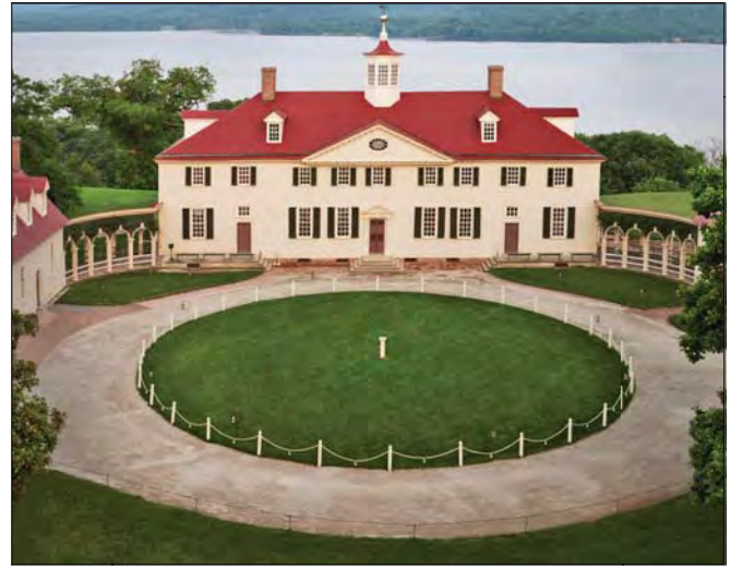
Mount Vernon on your bucket list? What better way to visit, or re-visit George Washington's quaint plantation than with your brothers and sisters of the TLCB?