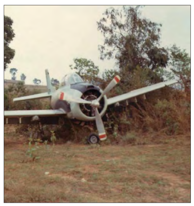
DH T28: A Royal Lao Air Force (RLAF) T-28 fighter-bomber that slid off the runway at L-108. This is a trainer aircraft, modified with guns and bomb/rocket mount points.