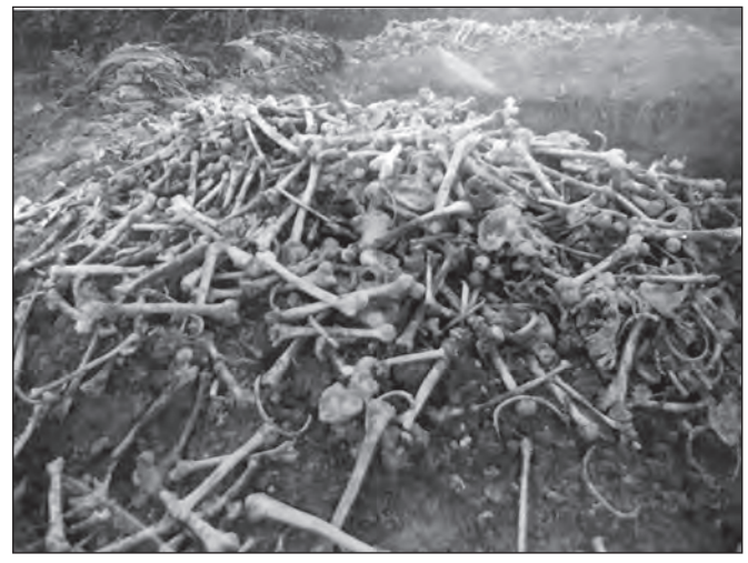
Gary's comment: "This is hard. The pile of bones is from an excavation site near the city"

Most disturbing was the obligatory visit to Tuol Sleng, the notorious Khmer Rouge prison. It was here that political prisoners, merchants, teachers, musicians, spectacle wearers,