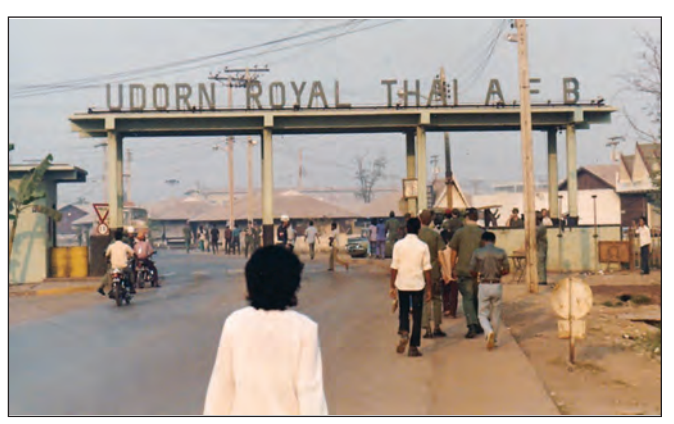
Main gate at Udorn.

After just a week, I'm off on a 45-day TDY to Udorn RTAFB, located about 30 miles south of Vientiane, Laos. This was a former Japanese base during WWII. This was in Feb 1973, and while there, we stayed in a hotel, a rented bungalow, and billeted on base. We had a team of three to install four single channel UHF transmitters and receivers, two HF transceivers, and two multi-channel UHF systems. We installed the radios in the operations building for the search and height radars, two large radomes. This site was close to the USO, and we ate breakfast there sometimes because they had awesome