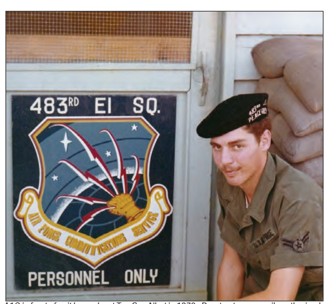
ATC in front of unit barracks at Tan Son Nhut in 1972. Beret not necessarily authorized.

I arrived as an airman first class for a year-long tour at Korat RTAFB, Thailand, April 1972, and was assigned to the 483rd Electronics Installation Squadron (EIS), informally called GEEIA (Ground Electronics Engineering Installation Agency), working in a ten-person ground radio installation work center. The 483 EIS had about 150 personnel assigned