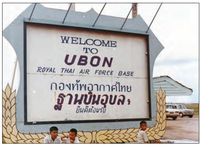
Main gate sign at Ubon.

in a downtown hotel because the next scheduled flight wasn't for three days, so with some free time on our hands, we visited all the local sights, including a temple with 300 steps to the top. We eventually got a flight out of Chang Mai on a C-47 to Don Muang Airport, which is north of Bangkok, and then took a taxi back to Korat right in time to go TDY to Kunsan Air Base in Korea.