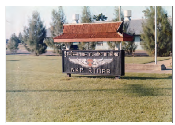
Nakhon Phanom RTAFB gate sign

In June 1972, a tsgt and I deployed to Kunsan for 60 days to learn/augment an E&I unit from Japan, and to install security systems in the bomb dump at Kunsan. The systems consisted of buried cable (maid-miles) outside the fence, mercury switches on the fence, and geo-phones to pick up vibrations on buildings and bunkers. All intrusion alarms were monitored by the security police. To get to Korea, we boarded a C-130 to Don Muang to remain overnight (RON) in Bangkok. The next day we flew a Flying Tiger 727 cargo/passenger milk run—Don Muang to Clark AB, Philippines; to Taiwan (Ching Chuan Kang AB (CCK); to Okinawa (Kadena AB); to Yokota AB Japan,