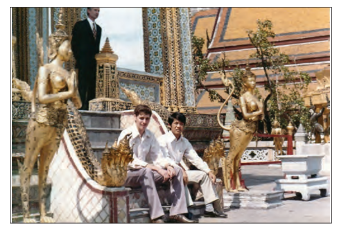
Temple in Bangkok, with Thai guide.

in a new building on the same road as the main gate, down past base supply. The radios were "remoted" into the command post. We stayed on base in a hooch near the BX, and for entertainment, we spent time at the communications squadron's bar, the Dragon Inn, went to the movies at the open-air theater, and took some trips downtown on Sunday. We worked six days a week.