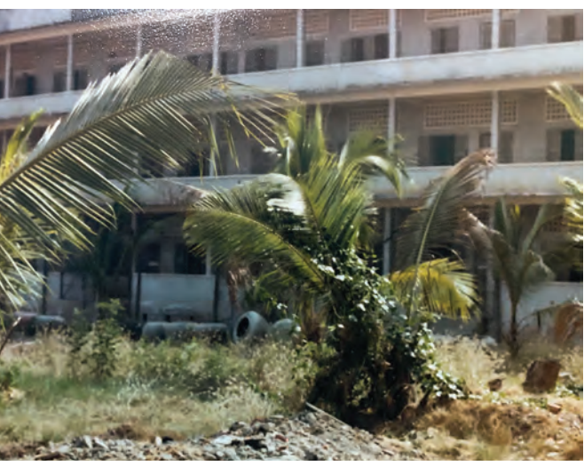
Hotel in Phnom Penh.

But this was not the Phnom Penh I remembered, and I found myself wholly unprepared. There was almost no commercial activity. A few fruit vendors trudged the streets with makeshift Phnom Penh continues on page 6 .