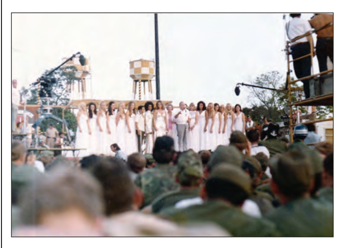
Vettel continues next page