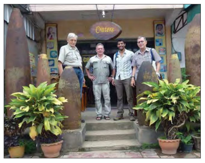
Long Chong school with new TLCB concrete floor.