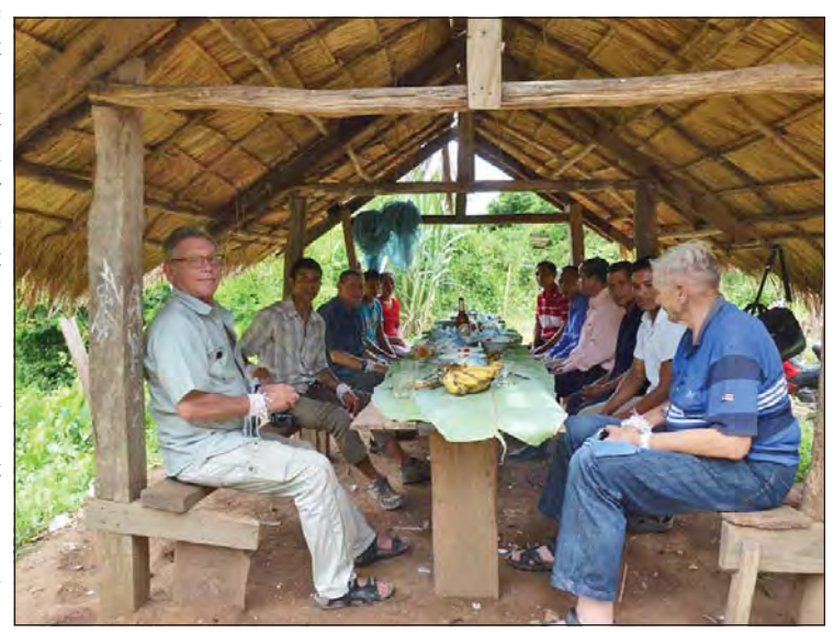
Impromptu lunch on the June trip.