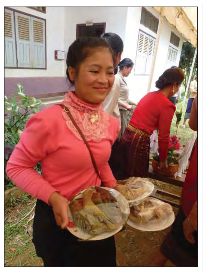
Happy Lao teacher greeting our gang with food for a feast.