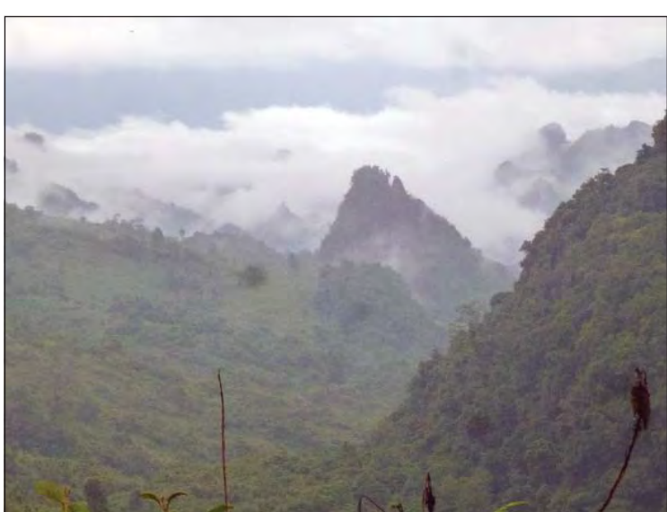
Morning in the Lao mountains near Long Chieng.