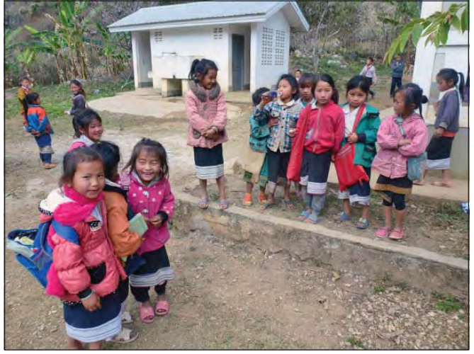
Nasala, where TLCB has funded new tin roofs for two buildings.

We traveled on further south to visit the Kong Lor Cave via longtail boats. Note: A reminder to Mac, you dummy, keep hydrated! I had an episode of heat exhaustion, worked on