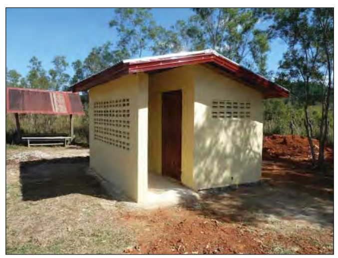
Ban NaFa villagers built this sanitary toilet using TLCB cement. A huge improvement over previous facilities that were in the way of a new road.