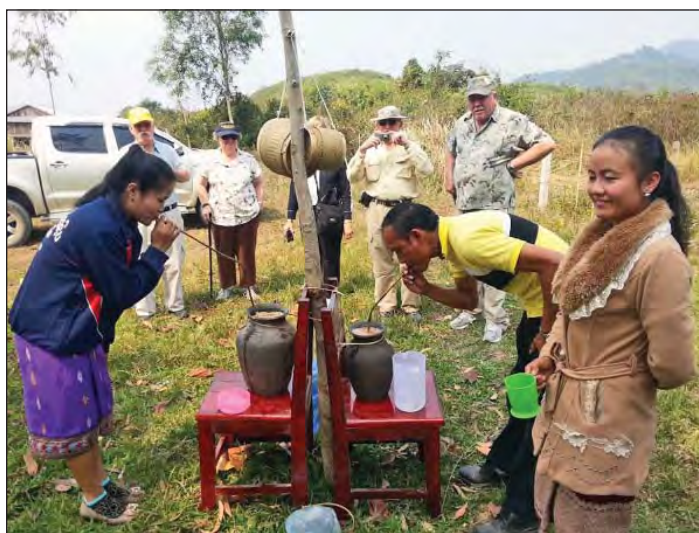
At Phieng Ta for a little "Lao hai" refreshment after viewing the new schoolroom replacement project, using TLCB cement and tin and local villager labor and wood.

Below, the old building at Khon Sana, where villagers have decided to use TLCB funding to build a new and much larger building. They will supply the labor.