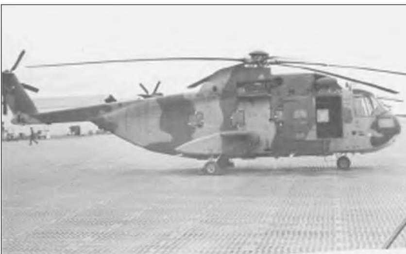
A "Jolly Green" at NKP. This is CH-3E serial number 67-14703, which was assigned to the 21st Special Operations Squadron from 1962 to 1972 and is now in the Museum of Aviation on Warner Robins Air Force Base, Georgia.

In late August 1967, the first HH-53B Super Jolly Greens arrived at Udorn. It took about a month to show new crews