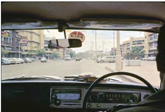
Above, limo ride in Bangkok. Taken in late May 1969. In the photo you can see "Pete," the limo driver with his chauffeur's cap on the dashboard. Also street scene of Bangkok.