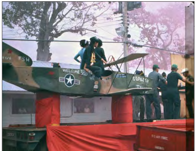
Above, Red River Rats parade at Ubon, Date taken unknown. The RRR's were fighter pilots that had gone north to Hanoi.