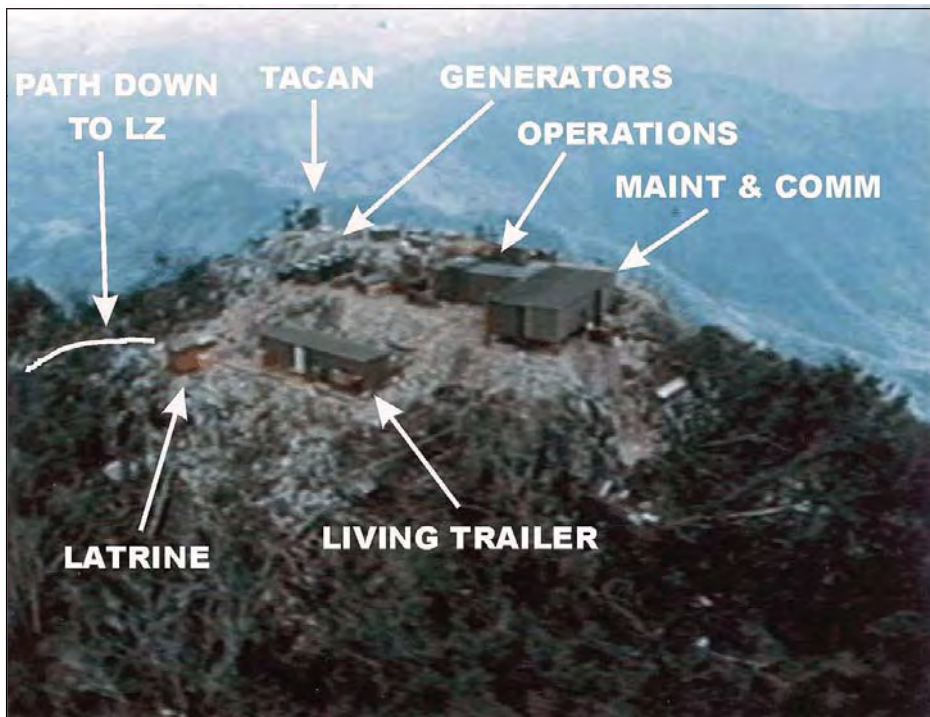
Commando Club installation on top of the mountain. The Battle of LS-85 and other details were declassified in 1998, according to Wikipedia.