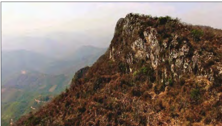
Phou Pha Thi, a Northern Laos karst mountain, which was the site of LS-85 and the Commando Club TACAN and Skyspot operation.

During the last portion of the five-hour firefight, an Air America Helicopter