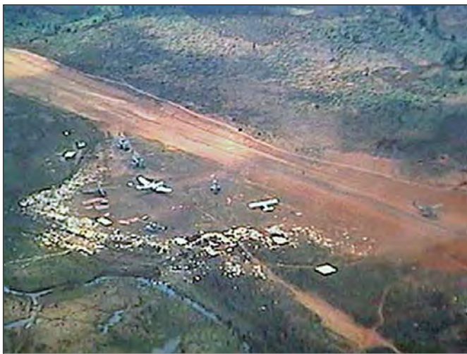
Lima Site 36 at Na Khang, Laos, LS-36, during the Indochina War. In this photo, there are two USAF Jolly Green H-3 Search and Rescue (SAR) helicopters left of center. There are also two fixed wing aircraft at center, and it looks like a helicopter off to the right. Na Khang was located in northeast Laos, not far from the North Vietnamese (NVN) border. It was just a bit north of the Plaines des Jars (PDJ), a highly embattled region, and southwest of Sam Neua, a Pathet Lao communist headquarters. Just to the east, running southwest to northeast to the NVN border is Route 6, a crucial route for the North Vietnamese Army (NVA) to move men and supplies. This was the most hotly contested area in Laos. Photo and narrative by permission from Ed Marek and his website, www.talkingproud.com .

In the late spring of 1967, I was pulling alert at NKP when we got a call that a Road Watch team over on the Ho Chi Minh Trail had run into a problem. Seems one of the little guys had stepped on a land mine while the team was moving the night before and needed to be evacuated for medical attention. They were east of a very heavily protected section of the Trail. We planned a safe route in and out flying through a narrow gap between SAR continues on page 14