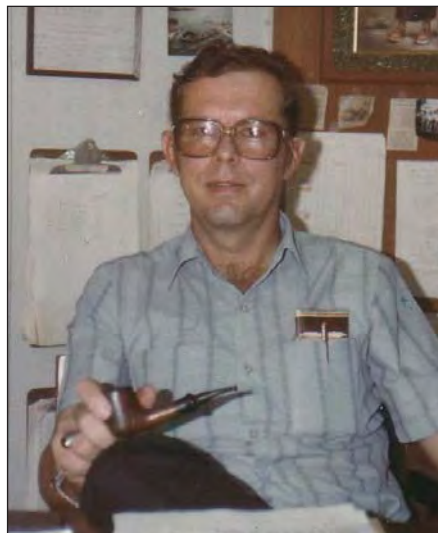
Mac in Bangkok office ca 1980. "Even more refugees and even more paperwork."

Mid-June finished the two year stint with IVS. I got $500 to buy a plane ticket back to Oregon, but I spent it on local living expenses and job hunting in the area. I went down to Bangkok to submit a couple applications and also flew over to NKP in a Thai Airways DC-3 to the old gravel runway downtown, close by the Mekong River. Back in Vientiane, I was waiting for one of the applications to bear fruit and was running out of funds; hmmm. While having