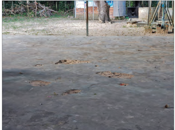
The original concrete floor at Banteay Samre Primary School was failing. Construction money came from outside, but there were no funds for upkeep. The villagers showed willingness to do the work.