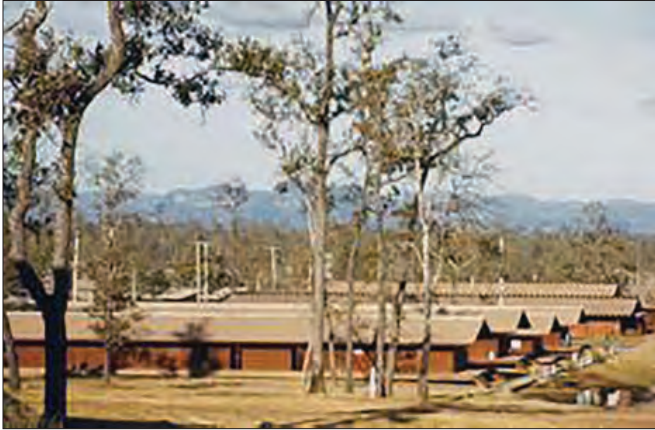
Nakhon Phanom RTAFB hooch area.

was the last local flight around NKP that it would make before being flown over to Udorn. Later, I was told that it was the last HH-43 to leave SEA. Rumors of when NKP would close spread like wildfire and changed daily. Speaking of wildfire, we had a large wildfire on NKP in the Thai Air Force area, which burned a large area of jungle/forest. No structures were lost and no loss of life. Most importantly, we kept the fire away from the Thai Restaurant and the other little Thai food stands located under the Thai Restaurant, one of my favorite places to order food from. Weekly, we had small wildfires around the base perimeter caused by a trip flare being activated by an animal, a human, or even a large Cobra. Snakes! I need to mention I think I saw at least one snake every day I was at NKP, under hootches, around the base perimeter, edges of the taxiways,