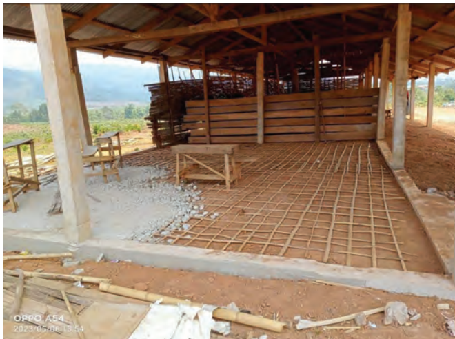
Partly poured floor of unfinished school repair in Nakai area. Access to this school in Laos includes a 1 1/2 hour boat trip, which was not possible on this trip because of low water. Other schools in this area receive good support from the power dam contractors.

Unfortunately, we have not heard back from the contacts in Nakai, and I need to follow up. I've asked the ex-student for up-to-date photos of the school and a request to take us with her on her next trip home.