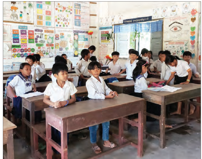
Cambodian schoolkids at Bantey Samre Elementary School, under a new TLCB-funded roof.

In early 2023, I decided to look for new areas in southern Laos. My retirement income mainly comes from renting out 20 plus rooms. Over the past four years, students from Laos have