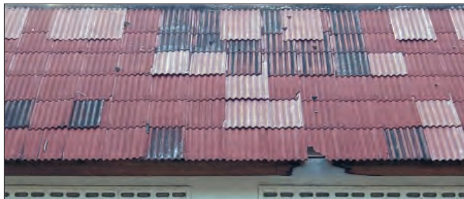
The first priority at Banteay Samre was the failing "holey" roof.