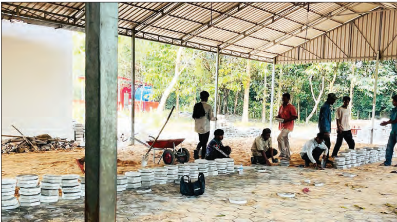
The tile floor laying is nearly complete, here. The success of this $3550 project is likely to lead to much more work in this area.

near the tourist area of Angkor Wat, but the schools I went to in Khammouane and Champassak provinces didn't jump at the opportunity like the Cambodians did. The Cambodians took the bull by the horns and didn't stop until it was all completed — in record time!