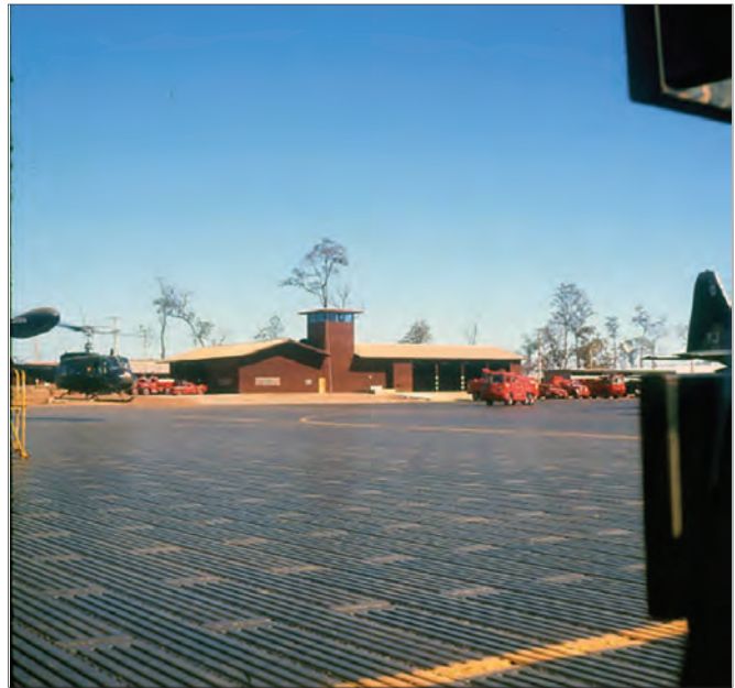
Nakhon Phanom RTAFB Fire Department, circa 1967.

Late August 1974 I left Alamogordo, NM for Travis AFB.