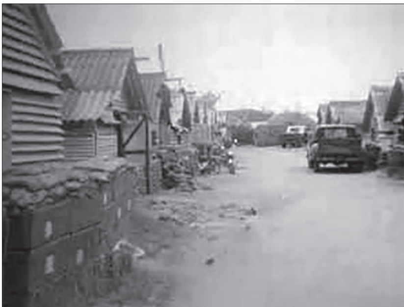
The Bien Hoa hootch area in 1967.

Additional photos in the September 2022 issue..