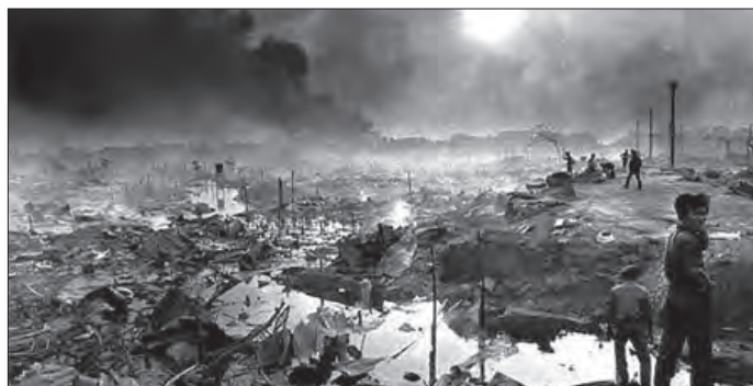
Bombing was much heavier than many of us knew.

From 1980 forward, the KR began their seasonal fights with the Vietnamese and PRK communist armies and were supplied by the PRC/China via Sattahip port and transported to border areas for delivery to the KR by the Thai Army. Other Khmer non-communist resistance groups began to coalesce with the primary armies being FUNCINPEC, a royalist army headed by Prince Ranaridh and Kampuchea People's National Liberation Front (KPNLF) army, primarily composed of former Lon Nol (Khmer Republic) fighters. All three of these groups recruited younger cadres from refugee camps along the Thai border. In the 1980s, Ronald Reagan began supporting the "non-