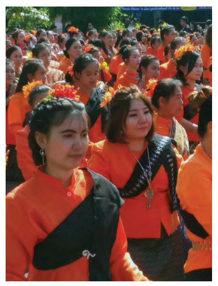
Girls marching in a parade during the annual street festival in Udorn City. Each group has its own color.

We traveled from Udorn to attend the Songkran Festival in NKP. Everyone was visiting the temples for the festival and sharing donations to the temples. I was fortunate enough to join in the procession of people making three rotations walking around the temple as is custom. They do the walk with a long orange roll of cloth that folks keep over their head as they walk