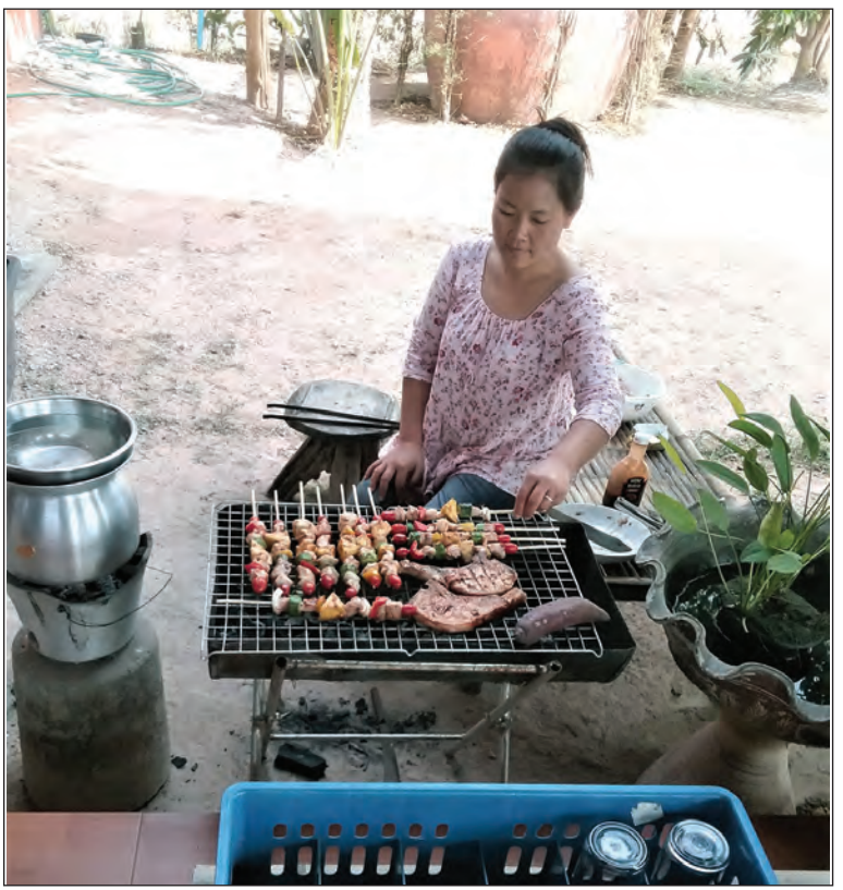
Remember the street-kabobs? These and other delicacies, often cooked in a wok while you wait, can be very good. Note the charcoal "stove" under the water vessel at left.

dollars+). I just will not stay at a less than decent room and also demand that my driver stays there also. A good night's sleep is worth it. We have had others traveling with us and they complained about a room for 32 dollars versus 18! I told them to stay there and we would pick them up the next morning. Really, a first-class room for 30-35 dollars and you want to sleep in a room that has a floor that you would hate to walk on, just to save 15 dollars? It's easy to forget what you pay in the states or other countries. Thailand seems to bring out the cheap in travelers; old habits, I guess.