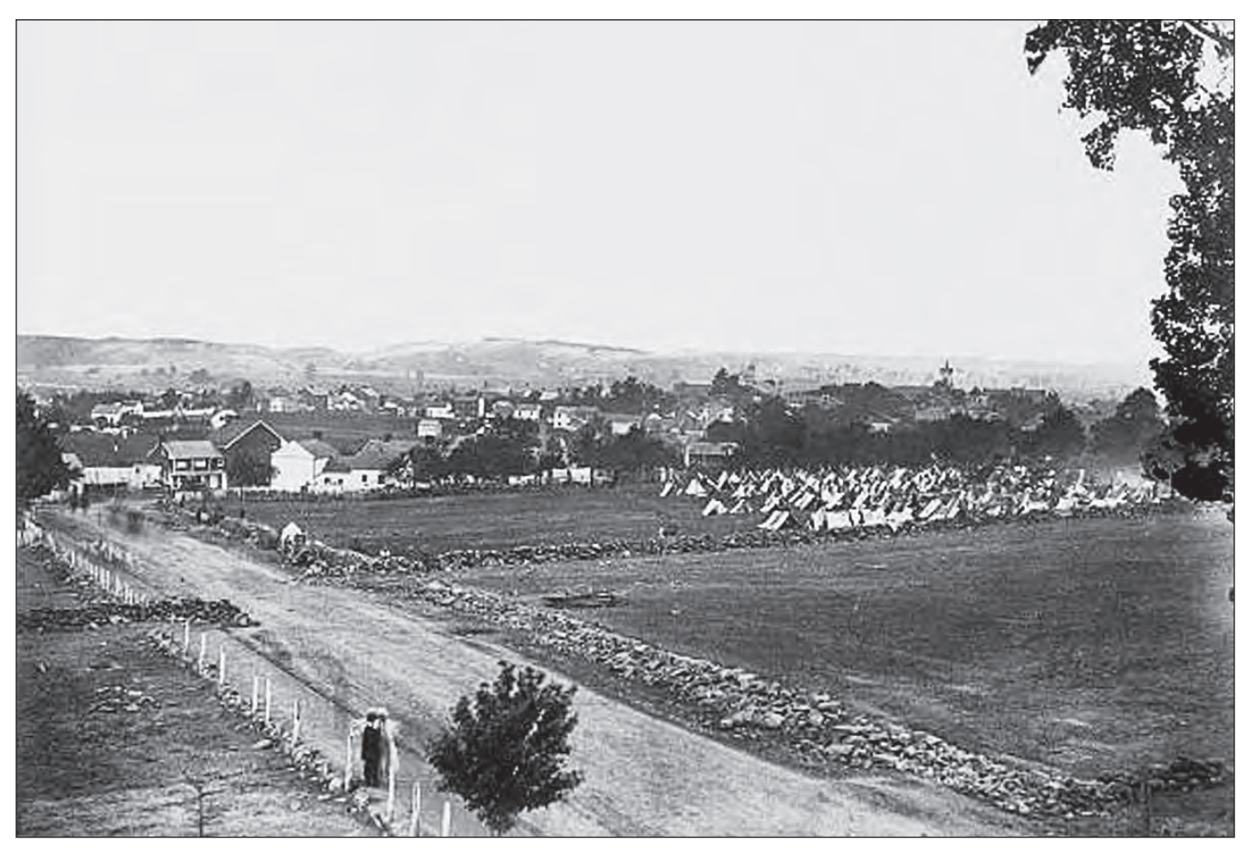
Tyson photo of Gettysburg in July of 1863. Also used by Timothy O'Sullivan. Photographers tended to take credit for images whether they actually took the photos or not. Neither Tyson nor O'Sullivan gave the location, merely labeling it as a view of Gettysburg. It appears to be on Taneytown Road, with a tent camp on the future National Cemetery grounds. Above that is the steeple of the courthouse. Yellow Hill, beyond Herr Ridge in the background, was a "station" on the Underground Railway.