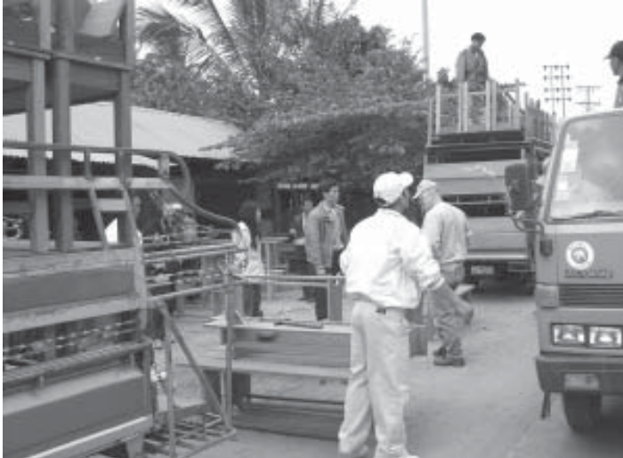
Above left, loading new school desks for delivery at Ban Nahom.