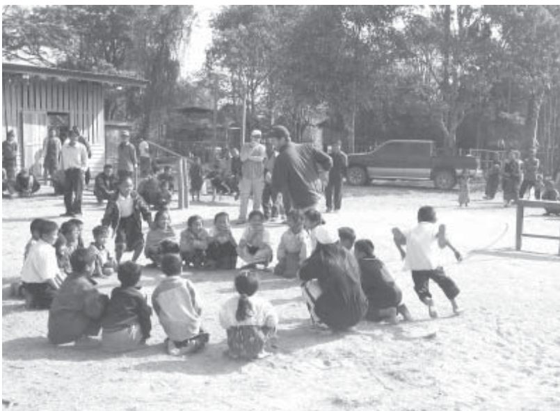
Left, playing Duck—Duck—Pig, a sort of a cross between Tag and Musical Chairs .

Bottom left, primary grade children at Ban Nahom School with a sign of gratitude just like their counterparts in Thailand. These kids really appreciate what is being done for them, and so do their parents and teachers.