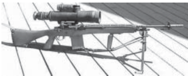
Figure 1. Shipping container, Starlight Scope and accessories.

Note: technical details were found in the original Army training manual. The Washington, DC, Reunion Committee expects to have a working AN/PVS-2 Starlight Scope on display at the TLCB 2005 Annual Meeting and Reunion (see page 2).