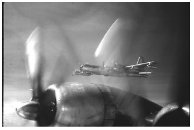
KB-50J wingman as seen from the co-pilot's window. Note auxiliary J-47 engines and wingtip refueling reel pods; also a pod in the tail. The propeller disc was 18 feet in diameter (do you have an 18 foot room in your house?)