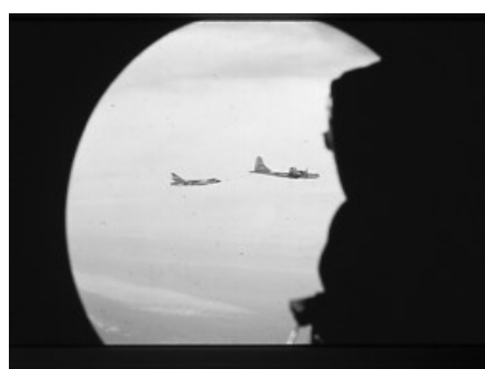
The author watching from KB-50J's left blister, or refueling operator station, as wingman refuels an RB-66 over Louisiana in 1963.

Not so friendly were PACAF and TAC. All Pacific-based KB-50s were grounded except for one-time ferry flights to Davis-Monthan AFB for "flyable storage," meaning no maintenance was to be performed and no preservation steps were to be