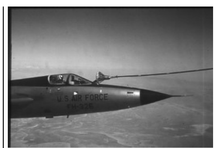
F-105 hooked up and taking fuel from the left reel of a KB-50J over the Mississippi River, 1963,

taken. Meanwhile Guam-based WB-50 weather recce planes were found to have extensive corrosion under the paint of the main wing spars. These, too, were permitted one flight to Tucson. The era of the B-29/B-50 was shoved to a