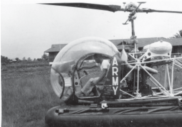
Bell H-13 used for mapping support out of Jungle village.

It was spring when Bob arrived in Bangkok, so he got to enjoy the summer monsoon. Many of our members will recall the daily warm rains and steaming humidity of Southeast Asia at that time of year. Life at Ban Kapi was good, but sometimes there were challenges. For example, after a really heavy rain-storm they had to wade in up to a foot of water to get to their hotel, and when they got to higher ground, they immediately checked for leeches since much canal water was mixed in with the floodwaters.