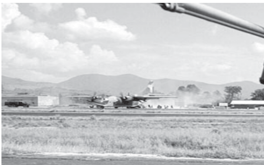
Photos from the author's website. Top, Soviet tank destroyed during Central Highlands battle of Kontum. Right, USAF C-123 at Kontum.