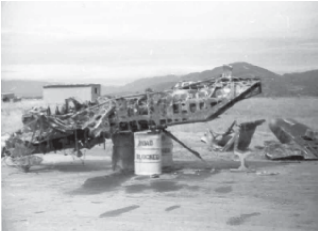
May be remains of a fighter that burned after double flameout on takeoff from Da Nang, owing to fuel contamination (water).

ture of the new aircraft was radar. F-5A and F-5B did not have airborne radar. The F-5E and F-5F had the AN/APQ-159 X-Band radar with a lead computing optical sight linked to it. As they came into the VNAF inventory, the F-5Es were sent to Da Nang to relieve the F-5As on alert duty. The VNAF maintained two F-5s on 5-minute alert and two on 15-minute alert at Da Nang. They stood alert at the same pads that the USAF used during its stay at the base.