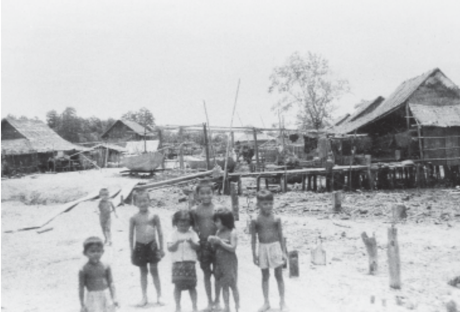
The "jungle" village used by helicopters for forward support of Army mapping operations. Above and at bottom of page.