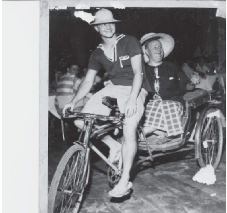
Sailors rented (or maybe not) for JUSMAG party at Ban Kapi, near Bangkok.