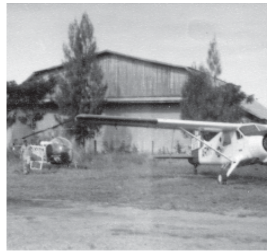
Above, DeHavilland L-20 "Beaver" at Don Muang hangar. Below, for departure in C-124.