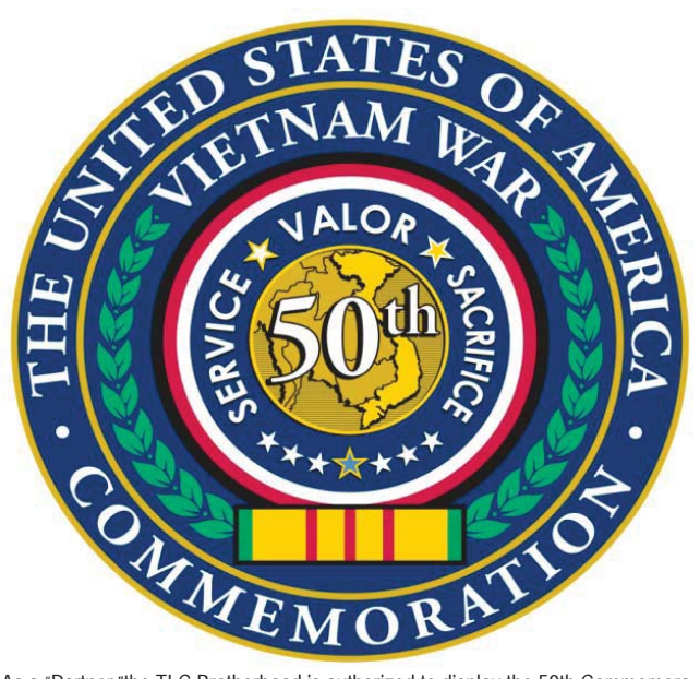
As a "Partner," the TLC Brotherhood is authorized to display the 50th Commemoration logo, except for use in fund-raising activities.

medicine related to military research conducted during the Vietnam War.