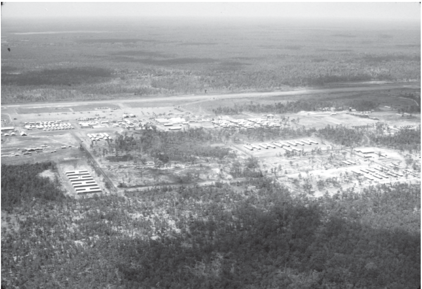
NKP RTAFB in mid-1966. Nong Han lake at Sakonnakorn, near the horizon.