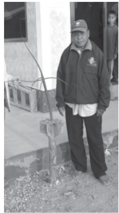
Igloo White sensor as landscaping at a guest house in Gnommarath, Laos, in February. 35-year Pathet Lao Army veteran stands by.

BP I was 19 when I went to Korat. I went in and did my work. I think I was pretty good at what I did. I made a conscious effort, where some of my co-workers would come in, high on pot, did not want to work. My buddy and I volunteered for things. I was engine-run qualified as a two-striper