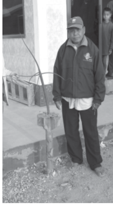
Igloo White sensor as landscaping at a guest house in Gnommarath, Laos, in February. 35-year Pathet Lao Army veteran stands by.

BP I was 19 when I went to Korat. I went in and did my work. I think I was pretty good at what I did. I made a conscious effort, where some of my co-workers would come in, high on pot, did not want to work. My buddy and I volunteered for things. I was engine-run qualified as a two-striper