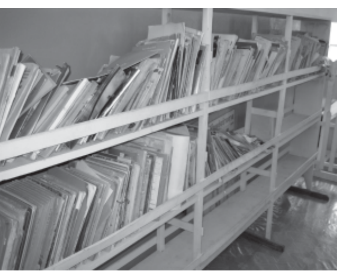
The Mekong Express Mail

Above and below are pictures of the existing libraries in two of the schools we have been helping under our Assistance Program. Bill found that the books are mostly more than 30 years old and are of little or no interest to students, consisting largely of teaching materials. One library was in the kindergarten building of a school and was not readily accessible to students who are now reading.