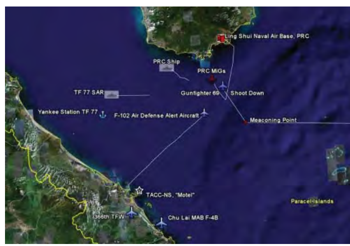
The Gulf of Tonkin, with Hainan Island at the top and Danang AFB at lower center/ left. This is whee the action took place.

In 1967, the People's Republic of China ambushed an unarmed fighter aircraft that was en route from the Philippines to Da Nang Air Base, near Hainan Island, China. The two American pilots ejected from the Phantom and were floating in the South China Sea, so I scrambled a U.S. Navy search and rescue helicopter to recover them. Meanwhile, the MiG