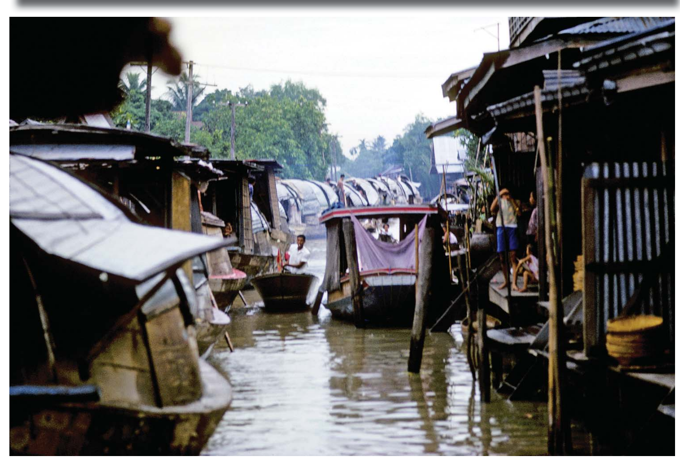
Bangkok's "Floating Market" in 1966. A tow of rice barges snakes through klongs off the West bank of the river. Such a scene is no longer possible because the Floating Market has been moved out to a tourist location. A few of the teak rice barges have been preserved as houseboats and floating restaurants.