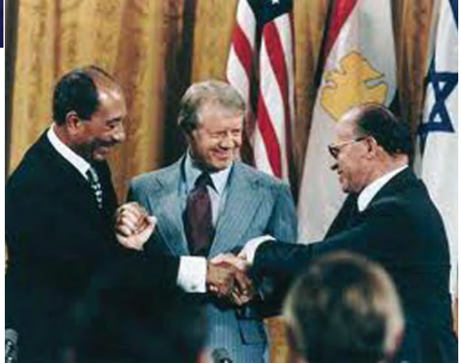
weeks after the 1980 Signing Ceremony, I had a visitor at my Pentagon office—the first secretary of the Embassy of Israel bearing a present from the general. It was his personal IDF [Israeli Defense Forces] Torah with a reference to Ezekiel 33 and his inscription: "We are the guardians of the gates of Israel..." It's been 32 years and the treaty has not been broken. God is with us.

a story about nearly losing his life during a 1956 June war tank battle in Egypt. That night I was reading my Bible and noticed the inscription note. My Bible was given to me upon my confirmation in June 1956. I added a note about Camp David, and the next morning gave it to the general as a symbol of our commitment to Middle East peace. A few