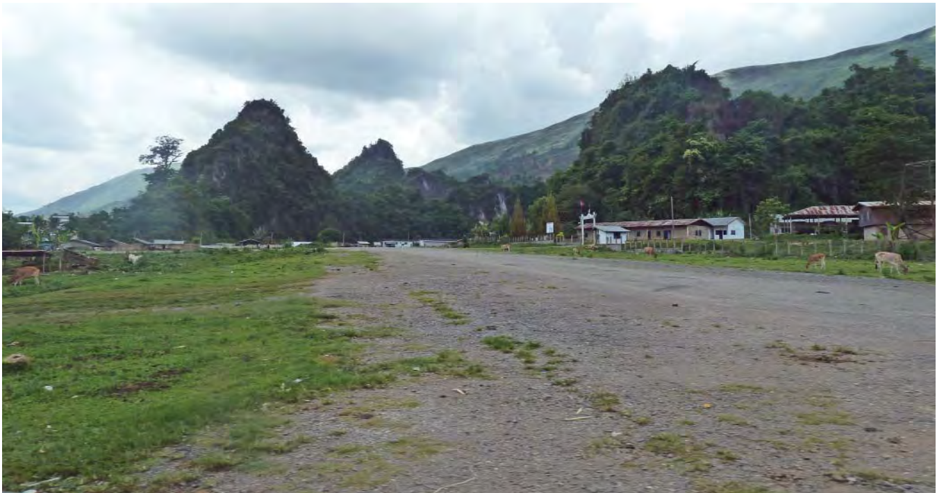
North end of the Long Tieng runway today, showing the karst arresting gear that has never failed to stop a plane! At right is legendary Skyline Ridge. Village, with General Vang Pao's house still intact, is to the left. Lao Army installation at right.