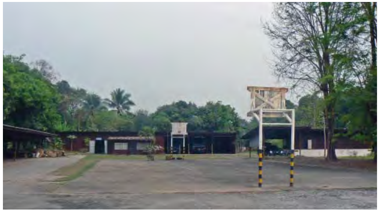
The basketball court, now. Vehicle maintenance shop is one of the few unchanged buildings.

And then, almost as quickly as it began, it ended. A Thai major, the site commander, appeared and he was clearly not pleased that someone besides him had allowed a civilian and an American on the site. I showed him my pictures of the old site, which included a circa Spring 1968 aerial photo on the entire facility. Although he spoke some English, he was remote and icy. When I asked if I could take