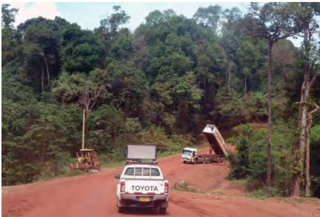
Above, road improvements and typhoon damage repair were seen in a number of areas on this trip. Right, Russian MI-17 outside a small village along the way.

I consider this perhaps the best project I've been involved with in Laos. It was a bit costly, which was shared with the Air Commando Association, but really worthwhile. It solved the problem of lower secondary school children (grades 6-9) who live too far from the school to commute daily. It was designed for about 70 kids, with boys' and girls' rooms, but some 180 showed up for the opening three two years ago! They cut it down to about 80 or so, with some others building grass/bamboo huts on the hillside so they could avail themselves of the cooking, bathing, and toilet facilities that were part of the project.