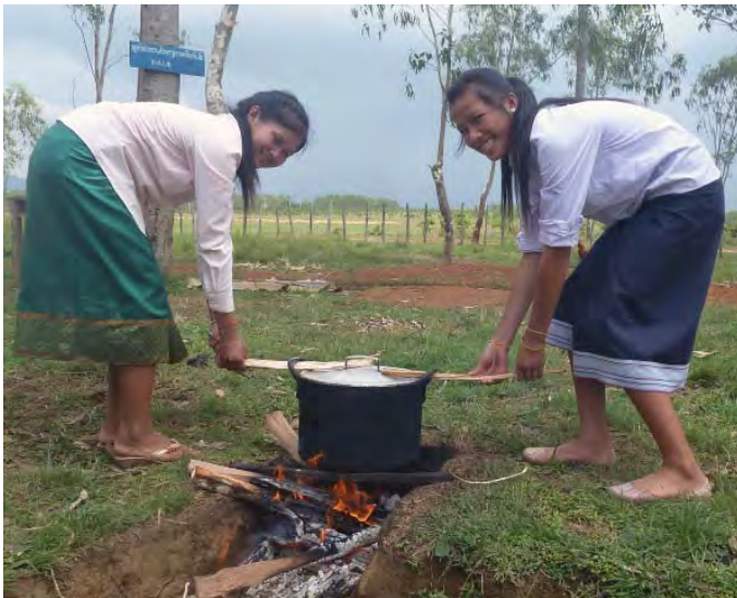
Up in the hill country, cooking rice the old fashioned way, in prepatation for another feast in honor of our TLC Brotherhood.

service to another vehicle. Capitalism strikes again! It looks like the large bridge here won't be completed for a while, as it has been under construction for more than a year already.