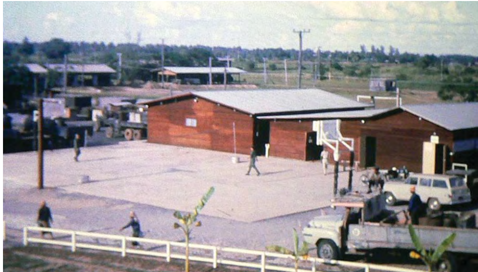
Ball court, Thai-American Lounge, and theater at Phitsanulok, 1968.

Also where our bathroom was, which was then an open space with no dividers between the shower area and the toilet, there was now another room. The remains of the bathroom were now in part of the space that had once been a kitchen. I tried to explain the changes, but