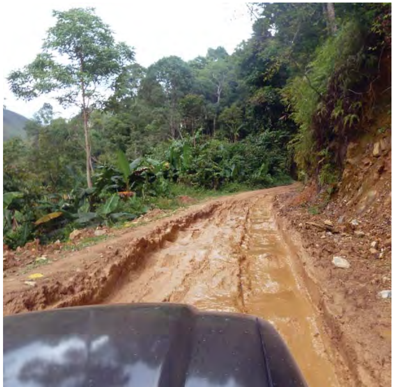
Sometimes the hardest to reach communities are the ones that need TLCB the most.

Thursday morning, we had a short meeting with the education chief, hand over kip 18,150,000 for a concrete floor for the Tham Lo school, then went on to the XSB police station to request a pass to get through the gate at Long Tieng, which was just handwritten and not a formal document. Taking this