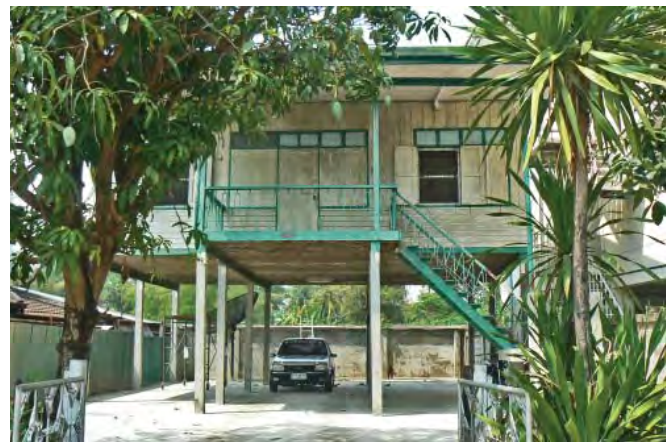
The bungalow, as seen today. Being restored but still much like it was inside.