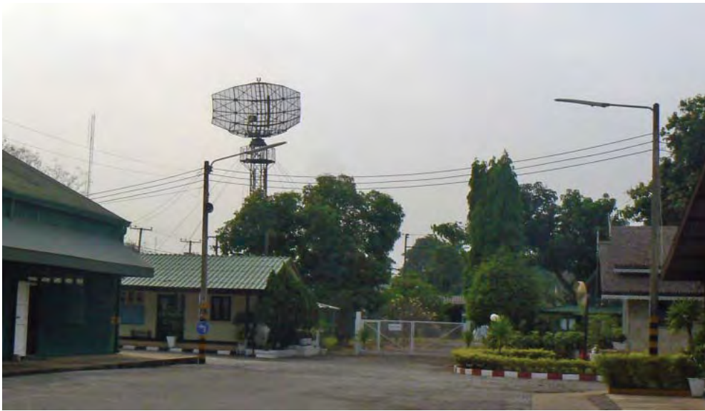
Above, this is as close as we got to the radar site today, but there is no mistaking it!