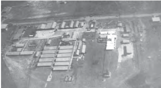
Aerial view of Phitsanulok base in 1968.

miles beyond the places I had remembered. Still, I had enough memory of the streets I travelled so often that I could follow a path to where my house had been, but there was no way to identify specifics of any of the structures. And when I tried to locate the radar site, Detachment 8 of the 621st Tactical Control Squadron, call sign "Dora," my luck was no better. It had been adjacent to the landing strip at the Phitsanulok Airport, abutting a Thai Base whose personnel worked the place with us. I knew that our Air Force had left the location some time in 1971 as the air war in Vietnam shifted focus. I also had heard that the Thai Air Force operated it as late as 1993, but