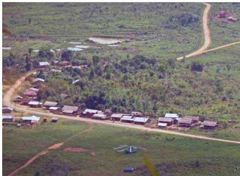
Laos is continued next page.

About 20 minutes south of Tha Thom we hit a bit of a blockage, high water in the Nam Xan, and a bus was stuck trying to get up the nearside muddy ramp, such as it is. We noticed a ten-wheel truck carrying a six-wheeler across in its bed. The innovative "ferry" looked like a good idea and our driver went back to check it out. I crossed over in a long-tail boat and Tony and Glenn got the VIP ride with the truck. Cost was kip 200,000, about $25, a bit high I thought, but given the alternative, it was worth it. I asked the truck driver what he was going to do when the river went down in six months, and he said that he would go back to work hauling logs from the forest. I didn't manage to get a receipt for the trip as the driver split to volunteer his