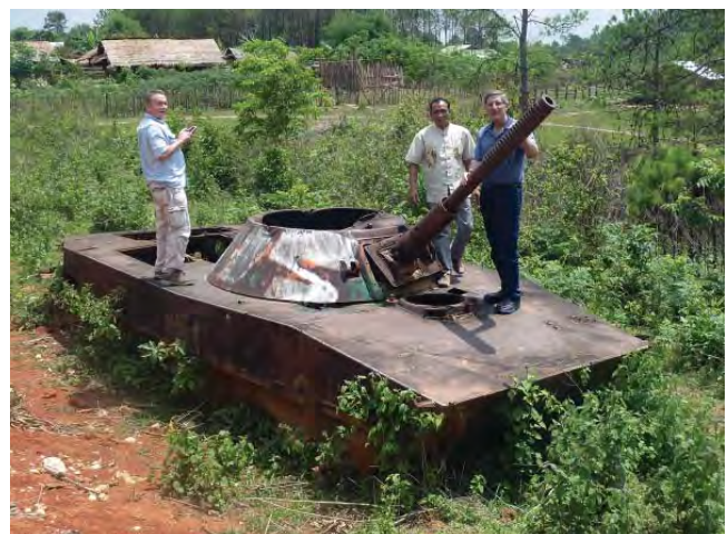
Laos is continued next page.

the representative on the Provincial Education Service who has been our main contact in Xieng Khouang for four years now, a real good guy, active, knowledgeable, and an excellent worker with the local school and village administrations which makes his proposed projects move right along. On to