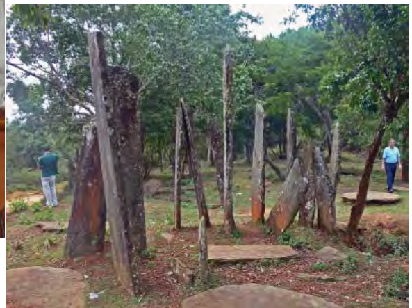
The "Standing Stones" enroute to Ban Pakha.

It was on to Jar Site #1 for a good look-see and walk around the