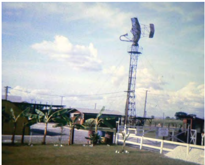
See Phitsanulok, continued on page 8.