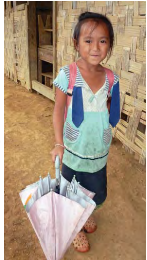
Who it's all about!

some new country. We left Phonsavanh and headed north on to Vieng Thong, aka Mounh Hiem, aka LS-48. The road was mostly good; with a few areas of reconstruction going on, post last August storm. We did hit one toll bridge, constructed since January when