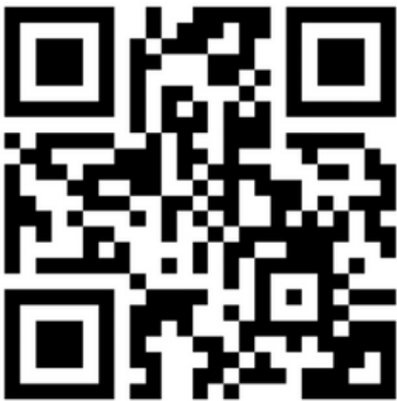
QR Code for 4th of July 2024

Scan the QR code or visit CahabRegionGroup.com to ENTER