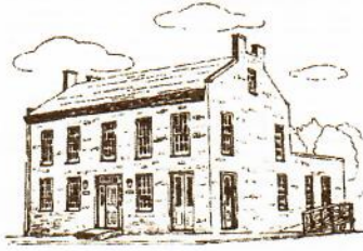
Houston Brick, c. 1845

Municipally-owned Water and Electric Utilities