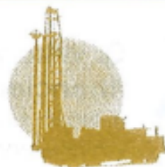
License No. 709506

WATER WELL DRILLING AND COMPLETE PUMP SERVICES sb@stehlybrothers.com www.stehlybrothers.com 760.742.3668