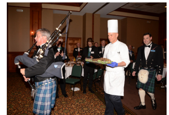
Piping the Haggis