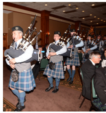
St Andrew's University Pipe Band