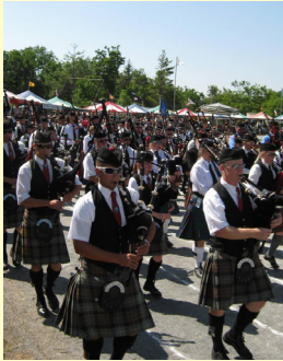
July 9-12, 2015 Grandfather Mountain Highland Games

The Society will host tents and provide lunch at both events.