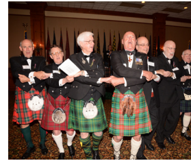
Auld Lang Syne