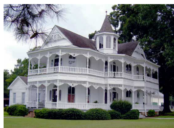
Historic John Blue House