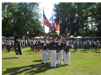
Light Infantry & Massed Bands Present Arms