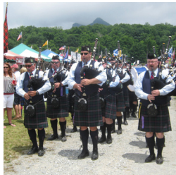
Pipers on Parade at Grandfather Mountain 2014