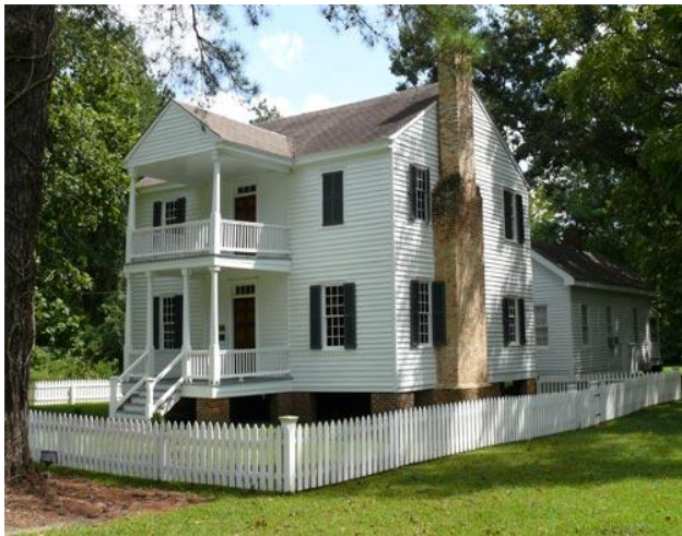
The Mill Prong House is located at 3062 Edinburg Road, Red Springs, NC, 28377 follow the link for more information & directions