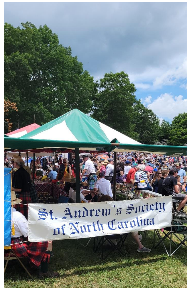
SASNC Hospitality tent at McRae Meadow