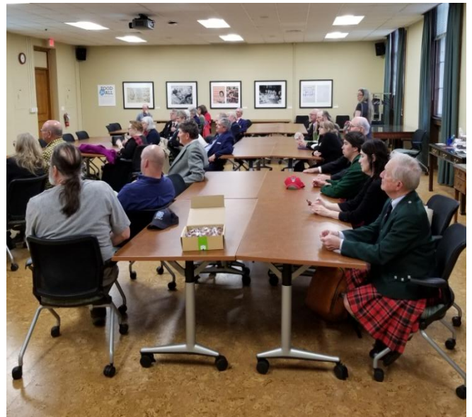
SASNC Reception Scottish Highland Immigrants Exhibit