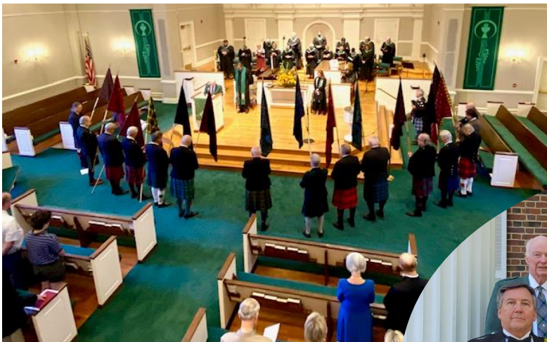
Kirkin' from the balcony of Brownson Memorial Presbyterian Church