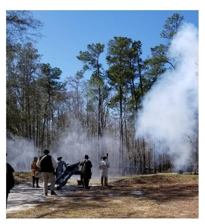
Patriot cannon affectionately known as "Mother Covington" facing loyalist bridge crossing