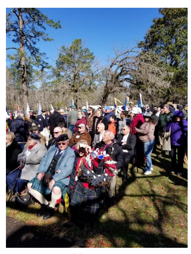
Wreath laying ceremony