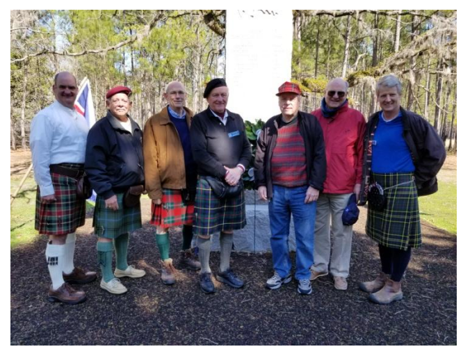
SASNC members at battlefield

A good day was enjoyed by a dozen Society members in February in recognition of the anniversary of the first N.C. battle in the American Revolution, the Lexington and Concord of the South.