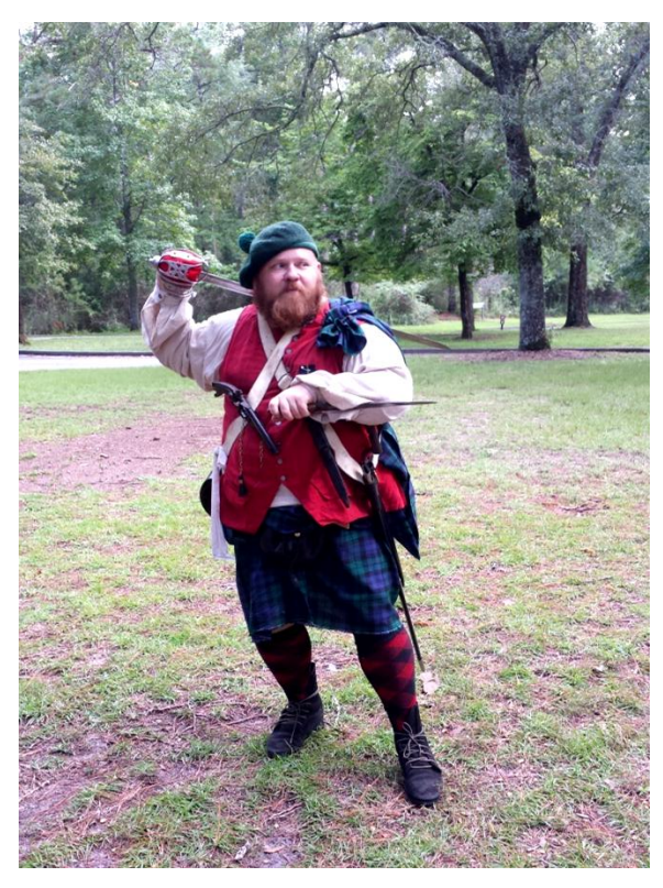
Loyalist reenactor (there was a piper but no kilts probably)