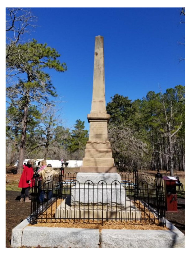
Patriot monument to James Grady, only patriot who died due to battle