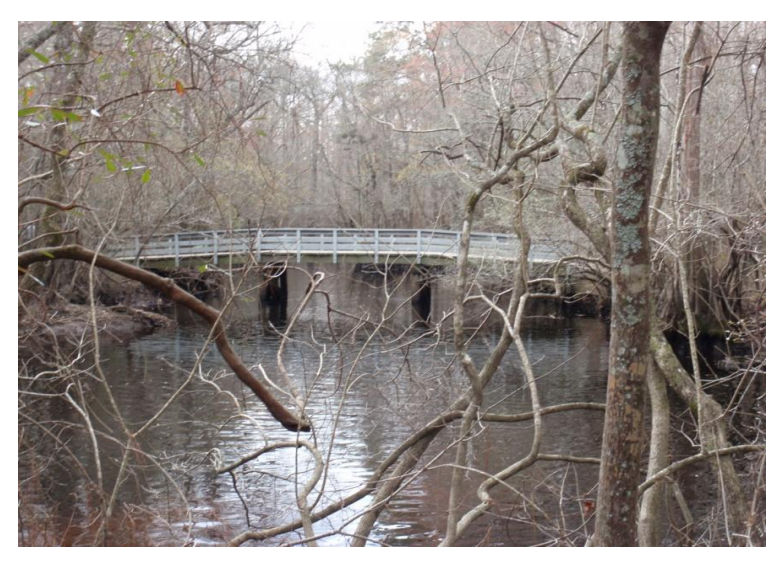
Current Moore's Creek bridge