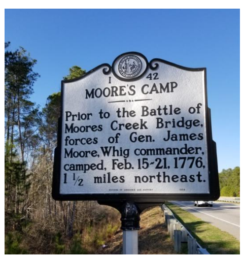
Col. James Moore militia camp blocking loyalist crossing of Cape Fear, southeast of Fayetteville

As fighting snarled in the North, safety committees and militias in N.C. were formed in defiance of the Royal colonial government. Gov. Josiah Martin, in exile, called for all loyal subjects to serve as troops. The Royal Standard was raised in Cross Creek (Fayetteville) and 1600 Highland Scots and loyalists mustered. The loyalists were led by Brig. Gen. Donald McDonald and Lt. Col. Donald McLeod who were sent to N.C. to raise Highland troops. Their goal was to cross the Cape Fear River and join British forces at Brunswick Town in the mouth of the Cape Fear. Col. James Moore, commander of the patriot militias in SE N.C., trailed McDonald and the loyalists and repeatedly blocked the river crossing. Militias led by Richard Caswell and Alexander Lillington assembled on the banks of Moore's Creek, a logical crossing point to Wilmington 20 miles away.