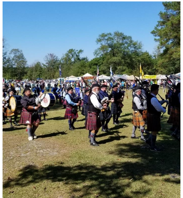
SCHG Massed Bands

Put this date on your calendar and come on over! More details to follow by email but we wanted to get this event on your calendar.