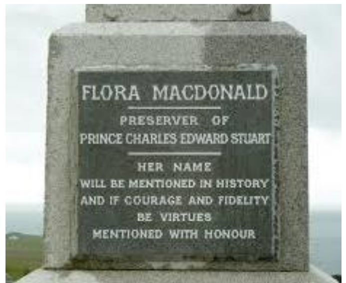
Monument at Kilmuir, Scotland Epithet by Dr. Samuel Johnson