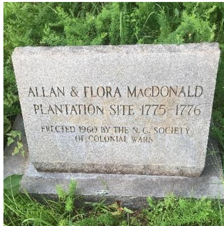
Monument at Cheeks Creek plantation site