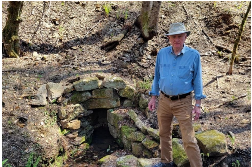
Flora MacDonald spring at Cheeks Creek site