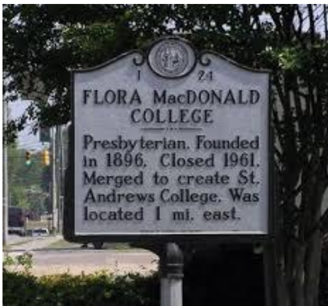
College in Red Springs, NC