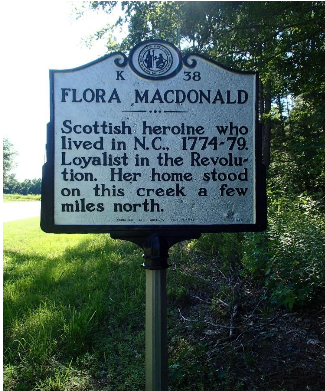
Cheeks Creek historic marker