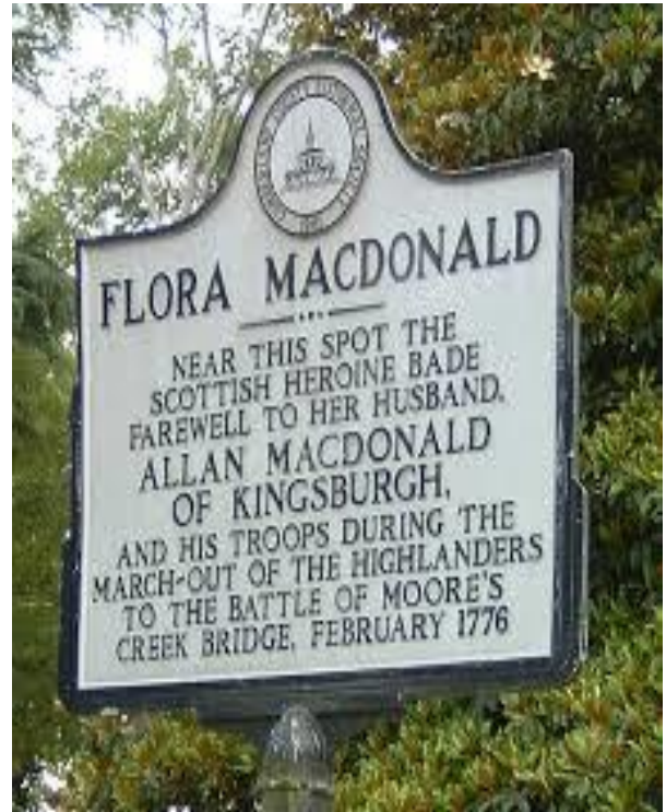
King's standard raised in Cross Creek (Fayetteville)