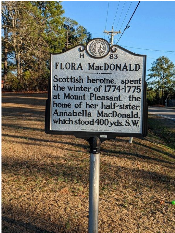
First residence after NC immigration