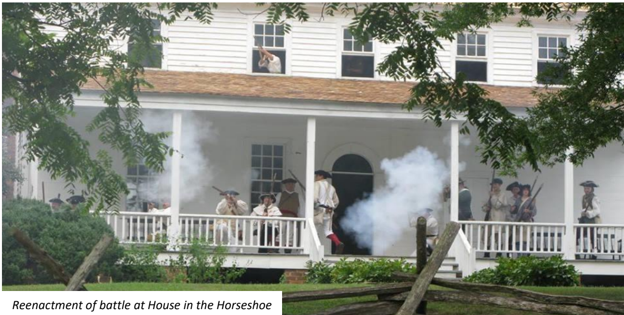
Reenactment of battle at House in the Horseshoe