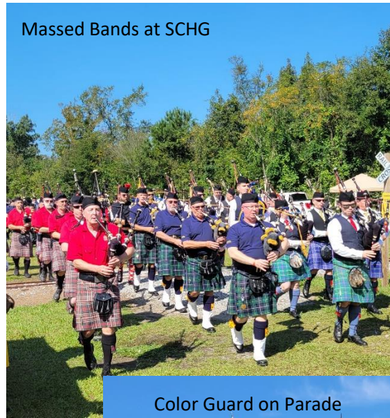
Massed Bands at SCHG