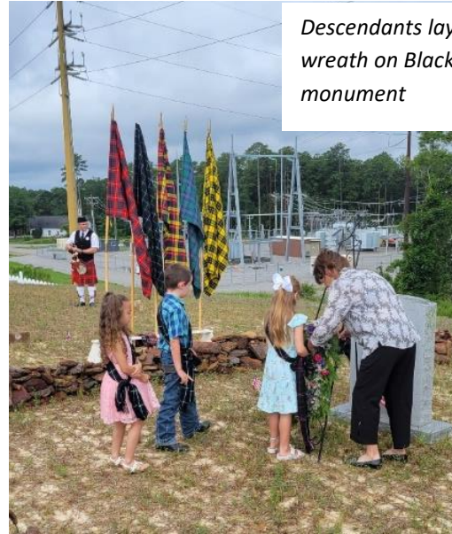
Descendants lay wreath on Black monument

The Alston House is currently undergoing investigative research. It is recommended that you call the day of your visit to ask about guided tour availability.