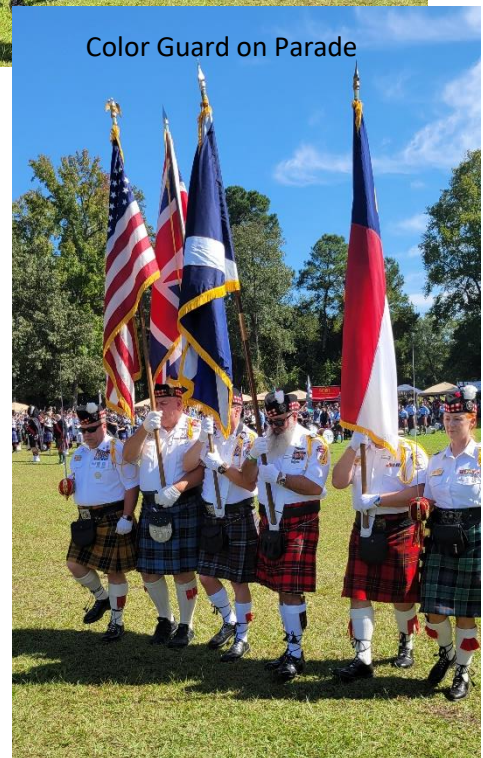
Color Guard on Parade