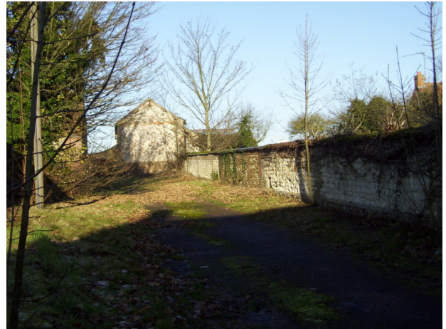
Walls and farm buildings are part of Fincham's character

Views are hard to come by because of the linear nature of the village although slight bends in the road do afford some views and glimpses are available down some of the narrow tracks to the north and south. The main view available is of St Martin's Church, on an incline, which dominates the eastern part of the village. The village gives a strong impression of enclosure, no doubt the result of its site on a main road, with much use of walls, gates, fences, railings and hedges. Behind these, buildings may be partially glimpsed, for example, the Old Rectory and Talbot Manor House, emphasising the sense of privacy. There are many treed areas and a number of good trees, particularly in the more open, western part of the conservation area and the arboretum to the north of Talbot Manor. The centre of the village is usually considered to be the open area around the Church, but there is no very obvious central point because of the linear nature of the settlement.