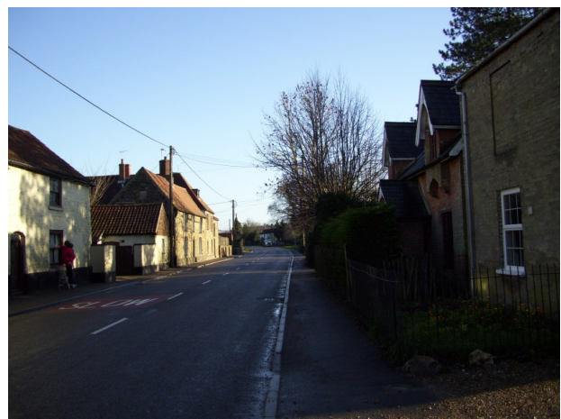
The main road through the village

Fincham is situated on the A1122, a Roman road and the main route between Swaffham, which lies 13 km or 8 miles to the east, and Downham Market which is 9 km (6 miles) to the West. King's Lynn is 19 km (12 miles) to the NNW.