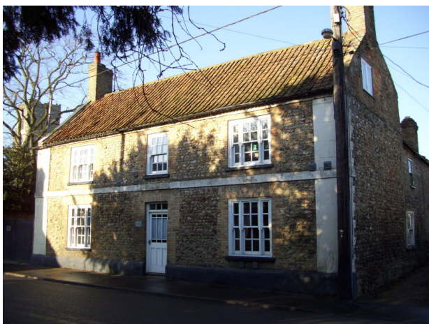
Crown House, formerly the Crown Inn

Well into the 20 th century Fincham High Street was full of small businesses, shops and public houses. The latter part of the 20 th century saw a substantial increase in the amount of traffic using the A1122 because of local industries, agricultural demands and tourism, which has put a certain amount of pressure on the buildings in Fincham. Although few businesses now exist in Fincham and most villagers work elsewhere, many are active in looking after the village and its buildings.