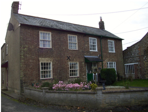
Lavender Cottage is one of many important unlisted buildings