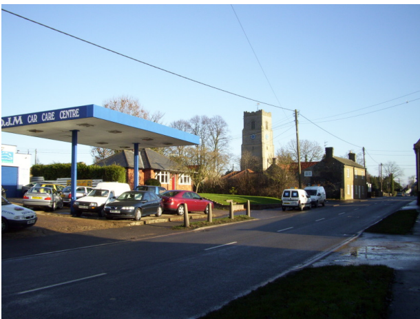
Garage with church tower behind

greatly to the conservation area. A thirties garage with its canopy in front is towered over by the Church tower and a post-war bungalow sits on each side in rather redder brick than is to be found elsewhere. The roadside verge here is dotted with concrete bollards. Behind this can be found some post-war bungalows and then, at the northern edge of the conservation area, a wonderful collection of farm buildings, picturesque in flint patched with brick and roofs mainly of pantiles, with timber doors, some of them tumbledown. These belong to Church Farm and some of them appear on the enclosure map, the group having been extended ever since.