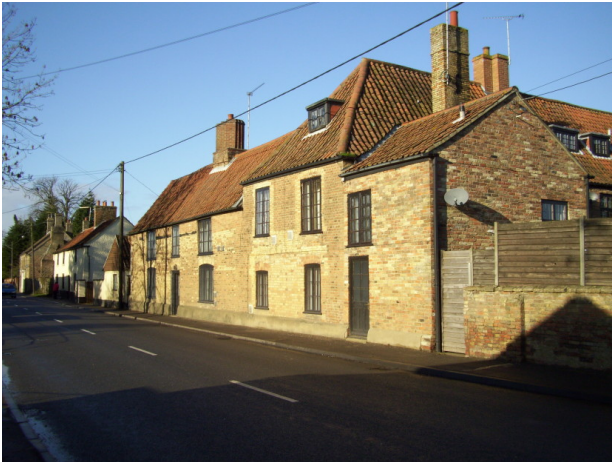
Many buildings are right on the pavement edge

Views are hard to come by because of the linear nature of the village although slight bends in the road do afford some views and glimpses are available down some of the narrow tracks to the north and south. The main view available is of St Martin's Church, on an incline, which dominates the eastern part of the village. The village gives a strong impression of enclosure, no doubt the result of its site on a main road, with much use of walls, gates, fences, railings and hedges. Behind these, buildings may be partially glimpsed, for example, the Old Rectory and Talbot Manor House, emphasising the sense of privacy. There are many treed areas and a number of good trees, particularly in the more open, western part of the conservation area and the arboretum to the north of Talbot Manor. The centre of the village is usually considered to be the open area around the Church, but there is no very obvious central point because of the linear nature of the settlement.