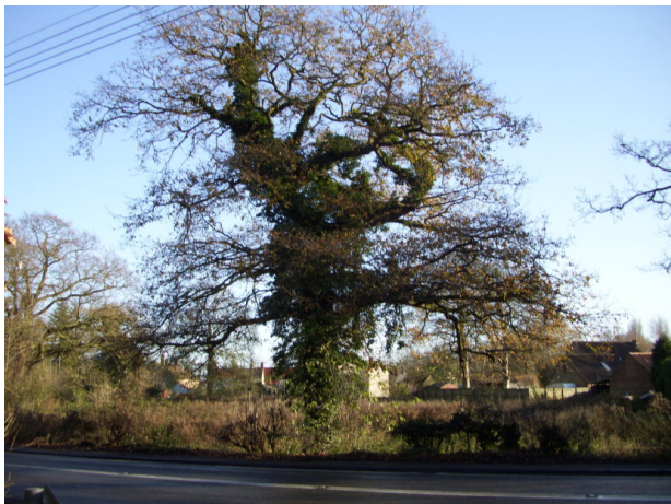
Looking towards Bretts Cottages from the eastern edge of the conservation area

includes the field behind Norfolk House and the White House, and the playing fields and runs along the back of Church Farm barns.