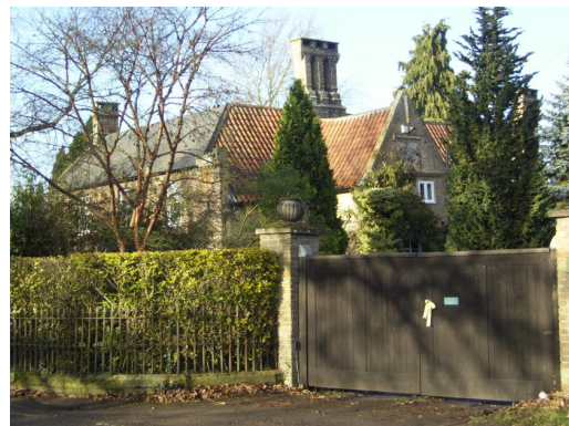
Talbot's Manor House

During the mediaeval period Fincham was a well established settlement with 13 separate manors. Within the conservation area, Baynard Manor, on the site of the present playing fields, is mentioned in the Domesday Book. Littlewell Hall, a moated manor house dating to before the 13th century has disappeared but the site of the moat is marked by a small depression. Talbot's Manor House is built on the site of a mediaeval manor house. At this time Fincham was surrounded by open fields and mediaeval ridge and furrow has survived as earthworks in several areas. Coins, pottery and metalwork from this period have been found by metal detectors, including heraldic pendants.