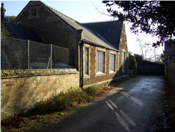
The former school building, west side

After the school a lane leads to School House and then next is Holly House, also grade II listed, set back from the road and barely visible from it behind a high wall of gault brick and a number of trees. The house is of c.1860 and is of flint and ashlar with a gault brick façade and slate roof. It was the village doctor's house between 1856 and 1978. Following Holly House, a lane leads to 'California', a series of cottages which appear on the 1839 tithe map. Beulah House next, a solid Victorian brick villa right up to the pavement edge with a decorative iron hood (created by the present owner) over the front door. Built around 1870, it was a butcher's shop and the building at the end of the garden was an abattoir. The opening up of the village is announced by the fact that two houses on the left are set back, Hill House and Church View (the probable site in 1802 of one of the first Industrial Schools), behind a long green front garden and railings.