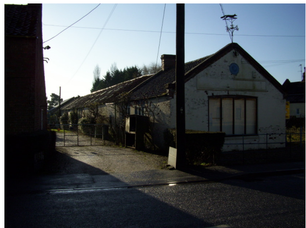
Former smithy and wheelwright's premises

Fincham's agricultural history. However they are currently not in use and in their dilapidated condition, with the untidy grassy yard in front, they detract somewhat from the conservation area. Then the double pile of St Mary's Lodge faces west in Victorian red brick, with crow-stepped gables and various extensions, in an attractive garden of trees and bushes with some good trees. Next there is a red brick cottage with gables and white painted barge boards of C19th date behind a tall hedge and railings, and, also gable end on, Midway Villa in gault brick behind railings, now two cottages with modern porches. Bryony Cottage reverts to face the street, and was originally four cottages. It is of five bays and two storeys and unusually for Fincham it is rendered and painted pink. It has pantiles and a nice original doorcase.