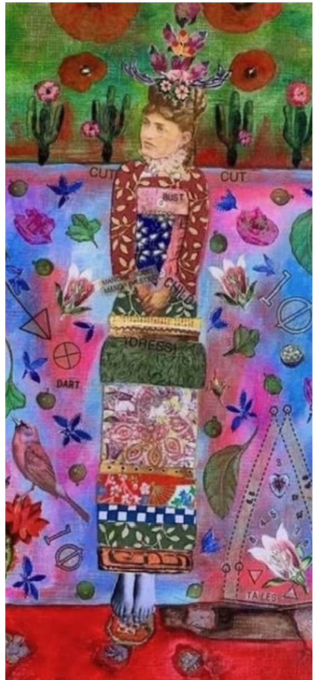
Art by Lupita Shahbazi

25 TRIBE COLD PLUNGE Multiple Health Benefits