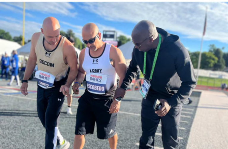
Coaching the Wounded Warriors Program