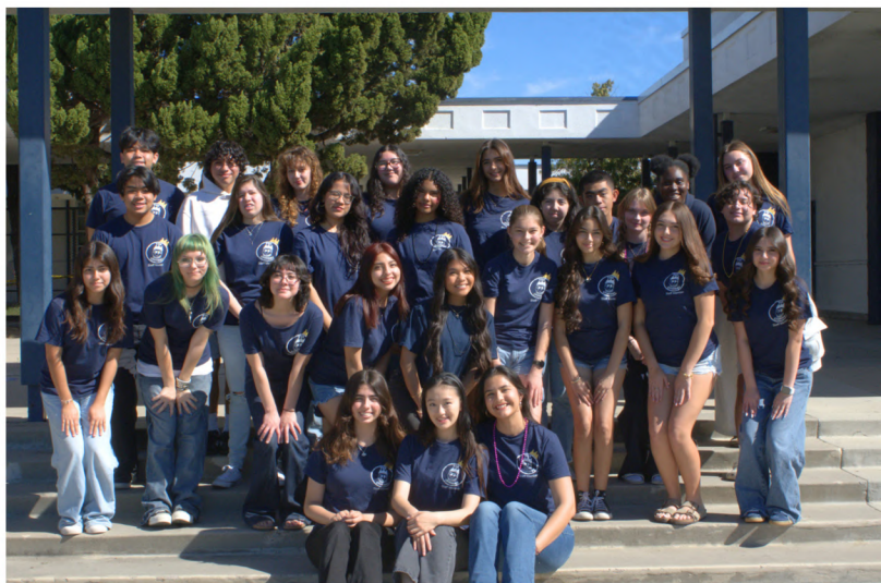
BVHS Crusader newspaper staff

BVHS has historically had programs with notable performance on local, state, and even national levels. In the realm of arts, Speech & Debate, VMD’s Sound Unlimited and Music Machine, theater, mariachi, and more flourish on campus to this day. A key highlight occurred months ago when Music Machine and Sound Unlimited had their 60th anniversary, something elaborated upon in issues 9, 11, and 12 found at www.TheTowneLocalBonita.com .