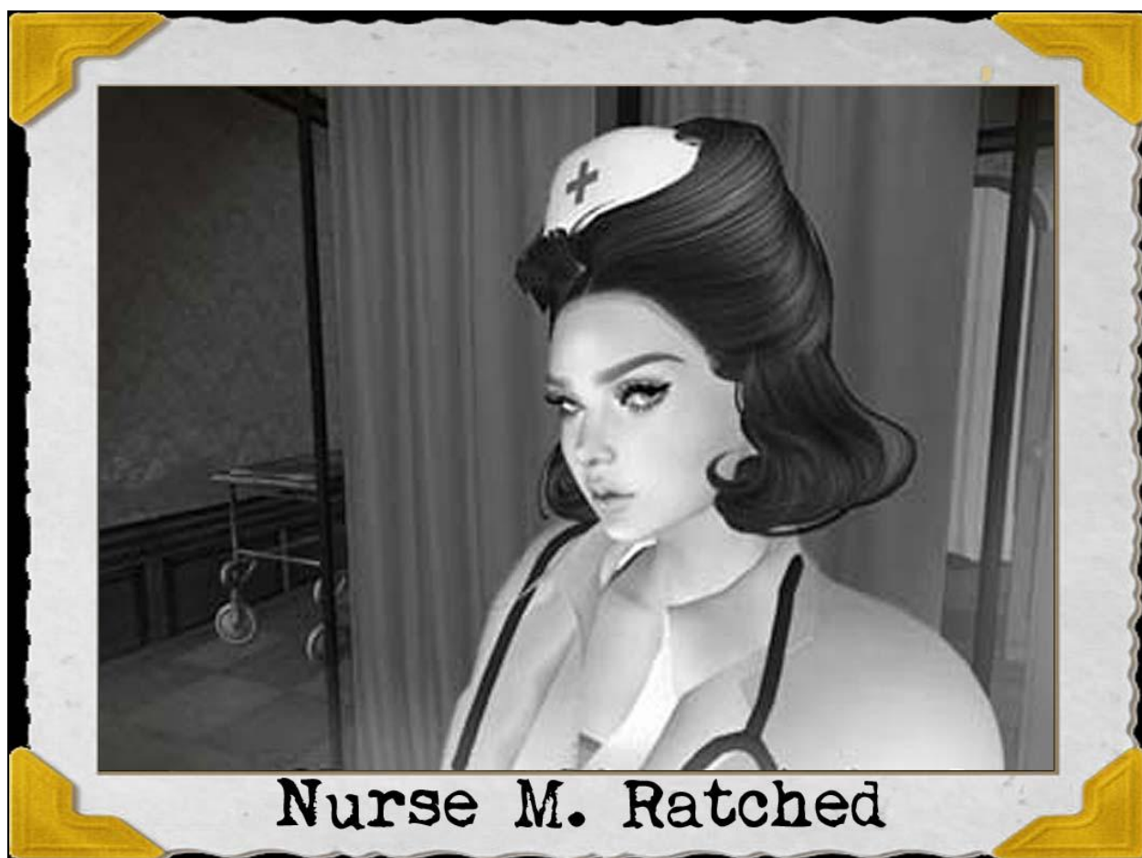
Nurse M. Ratched

Nurse Mildred Ratched early 30's Keeps mostly to herself. Obsessed with order. Very Single. Works as a night shift Nurse. Sticks to the books. Quick to punish those who don't help keep the order. Recently attacked by a patient and is set on "Curing them Indefinitely".