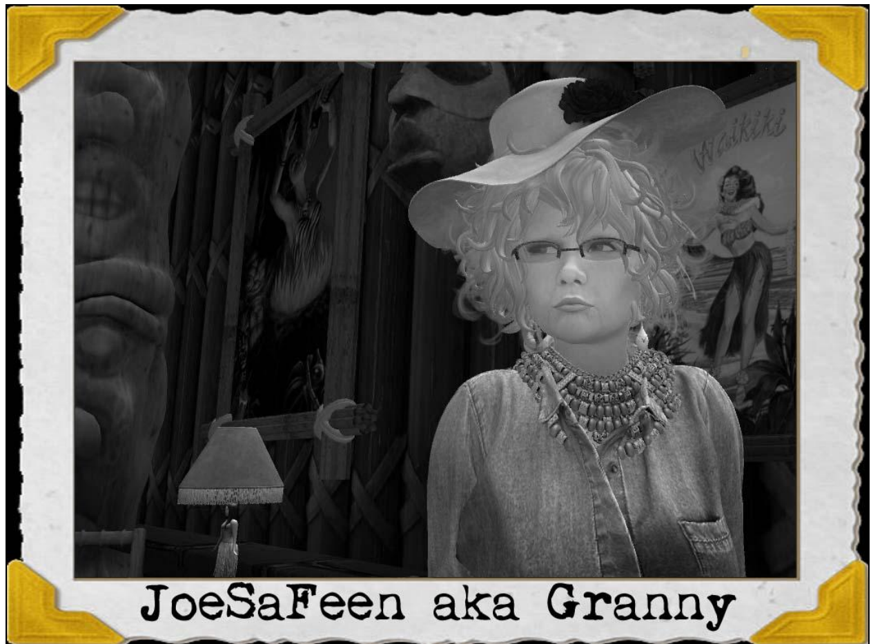
JoeSaFeen aka Granny

Granny was a visitor to the west coast escaping the taunts of NY. Joshephine Capone sister to infamous Capone mobster sells moonshine and other wares at that so call junk store who knows where she get shite stuff. She may be in her 60's but well say she's old enough to find trouble.