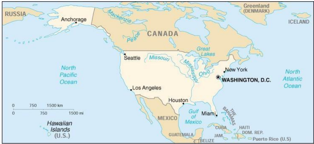
This map is based on public domain works from the U.S. Dept. of State and the CIA World Fact Book.