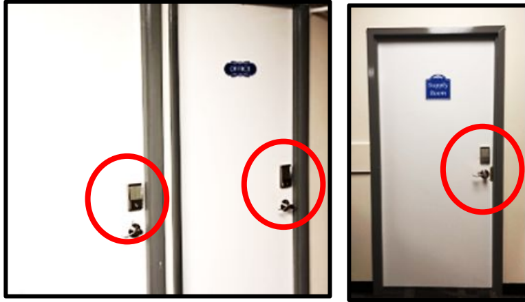
INTERNAL PROGRAMMABLE LOCKS