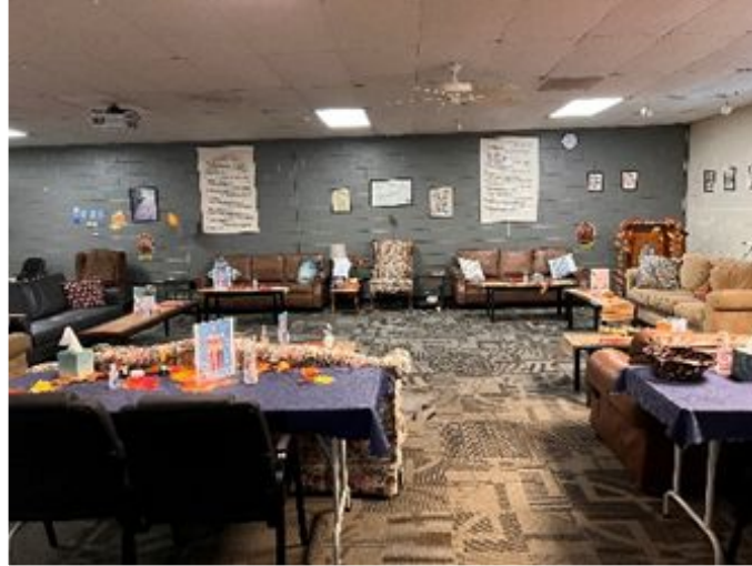
Replaced worn furniture with durable & modern look