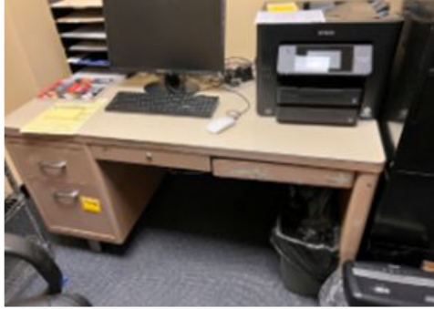
Replaced broken office furniture