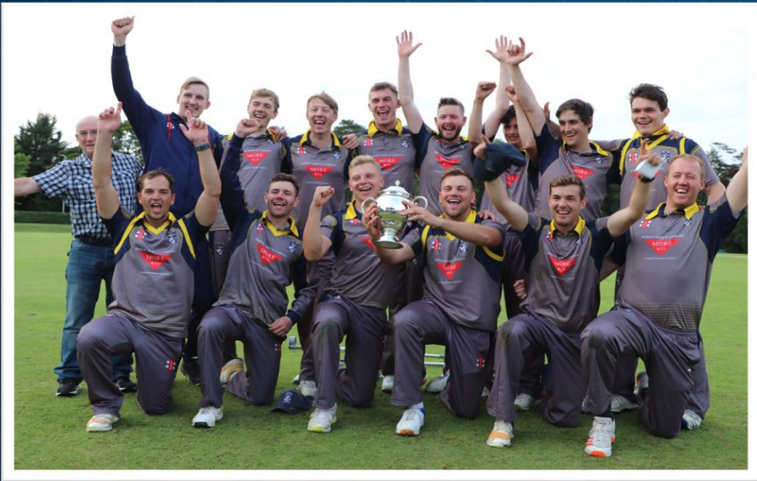
Heriot's Cricket Club

Heriot's Cricket Club was founded in 1889 and is one of the oldest cricket clubs in the Scotland. It was originally founded by the former pupils of George Heriot's School, but is now an open club. The club celebrated 125 years in 2014. Alongside this longevity, Heriot's Cricket Club has been a dominant force throughout Scotland in all competitions since inception, winning every domestic title available in Scottish Cricket.