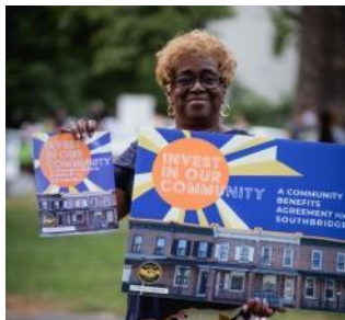
Resident advocating for Southbridge Community Benefits Agreement