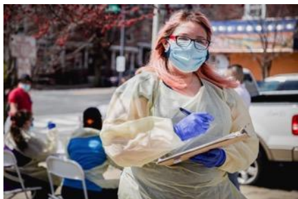
LACC clinic with staff

Community Need and Impact: Program staff are doing critical work to combat vaccine hesitancy and increase vaccination rates and it is essential that the program continues at the current service level to ensure Latinos are adequately protected against the spread of COVID-19. The pandemic is disproportionately impacting the Latino population in New Castle County. Latinos are experiencing higher rates of COVID-19 and greater financial burdens compared to other groups. The economic impact of the pandemic is especially dire for undocumented individuals, who are ineligible for government assistance. Maintaining the capacity of ConeXiones will mitigate the impact of COVID-19 and protect the physical and economic health outcomes of the Latinos in New Castle County.