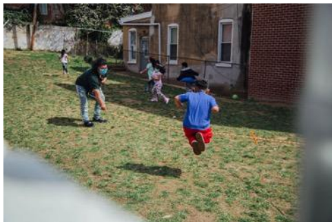
LACC children enjoy being outdoors.