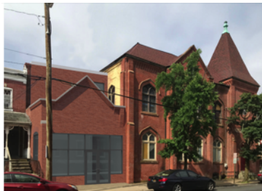
Proposed Alterations and Renovations to Epworth Methodist Church Building