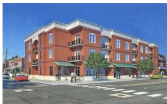
Rendering of Solomon's Court.

Solomon's Court will transform an entire block, formerly occupied by vacant and deteriorating buildings, into an anchor development that reduces vacancy and blight, increases affordable rental housing options, promotes local economic development, creates jobs, and supports the development of a mixed-use commercial corridor.