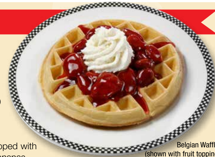
Belgian Waffle (shown with fruit topping)

BANANA SPLIT WAFFLE 15.99 Our golden Belgian waffle topped with sliced bananas, strawberry topping, pineapples & a scoop of vanilla ice cream. Finished with chocolate sauce & whipped cream