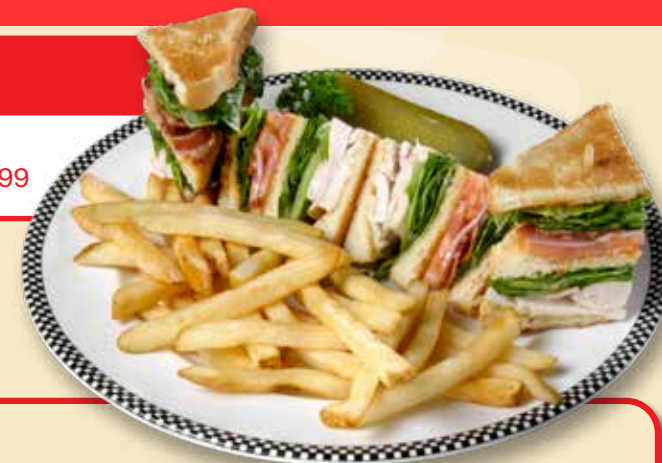
Johnny's Club House

CHICKEN & AVOCADO CLUB 18.99 Grilled chicken breast, bacon, fresh avocado, lettuce, tomato & mayo