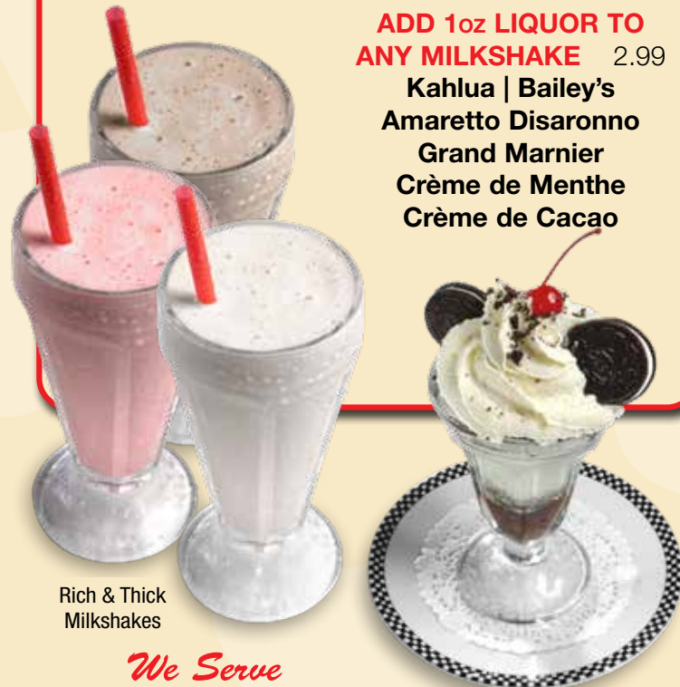
Rich & Thick Milkshakes

Kahlua | Bailey's Amaretto Disaronno Grand Marnier Crème de Menthe Crème de Cacao