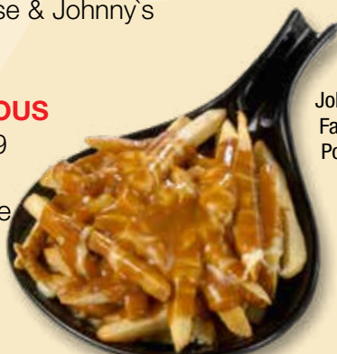
Johnny's Famous Poutine

JOHNNY'S FAMOUS POUTINE 11.49 Golden fries, St. Albert's cheese curds & Johnny's famous gravy